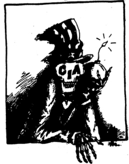
The real 'terrorist international'

But in today's world acts of international aggression have a tendency to destabilise the aggressors themselves. America's war of aggression against Vietnam generated a mass protest movement within the US which lobbied powerfully for the end of the war and thereby shook the confidence of a weary Admin-