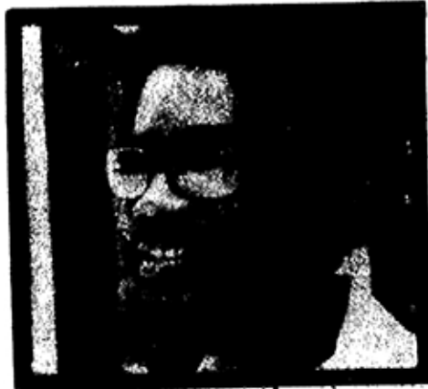
Dr. Walter Rodney: He was assassinated on June 19

It is an important debate, it is an important fact that such issues are being debated in this country today, just as they're being debated in Africa, in Asia, in Latin America and in many parts of the metropolitan world in western