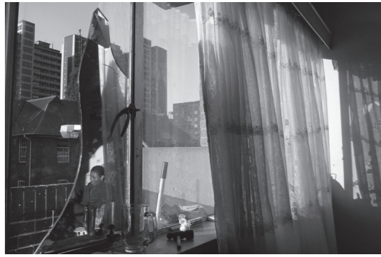
Fig.9 Pinky Masoe at her home in Sherwood Heights, Smit Street. The building's water and electricity had been cut off for four months