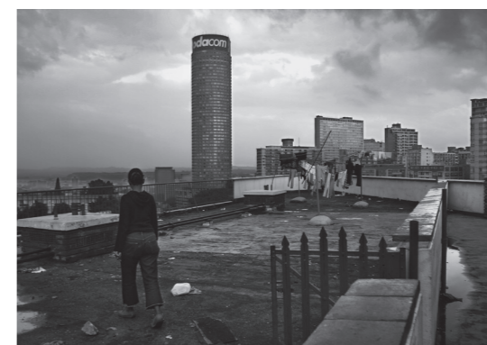
Fig.1 Al's Tower, a block of flats on Harrow Road, Berea, overlooking the Ponte building