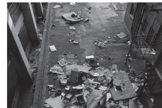
Fig.7 Eviction by the Red Ants, Auret Street, Jeppestown