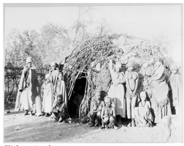
Click to view larger