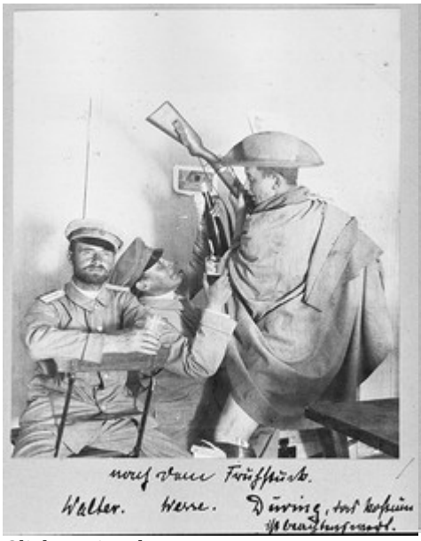
Click to view larger