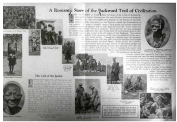
Click to view larger

Another important source of material is the use of photographs in publications. Official journals and publications – books, reports, pamphlets, and brochures – incorporated photographs to generate authenticity for their texts or frequently for propagandistic purposes. Many photographers were commissioned by their administrations to photograph official events and buildings and later many governments had professional photographers on their staff. Many government archives in Africa have surprisingly well-kept visual archives. Scores of these photographs were used in publications both official and unofficial, especially by travel writers. Many posters, pamphlets, articles, and books mesh photographs with text and together they tell a story. In such cases layout, cropping, and captioning are of critical importance in carefully crafting the intertextual meanings. This was especially important in photojournalism as practiced in the latter days of apartheid when photography played an important role in exposing the inequities and brutality of the system and it became important to emphasize the affective dimension or Barthesian punctum.