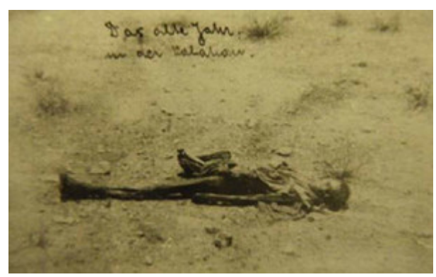
Click to view larger

One example is this postcard labeled by the sender as "The Old Year in the Kalahari" while the caption on the reverse claims it is "A dead Bushman dried by the Sun."