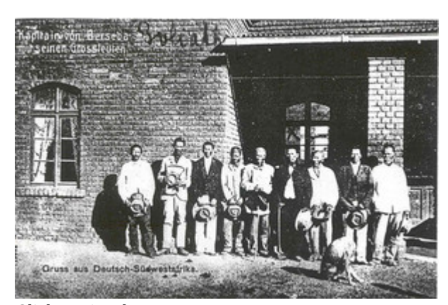
Click to view larger

Obviously creating the postcard was a reasonably complex and relatively expensive undertaking, yet why did the photographer foreground the dog scratching itself for fleas? Might it be a political statement especially since one of the worst swearwords in many parts of Africa is to call someone a dog?