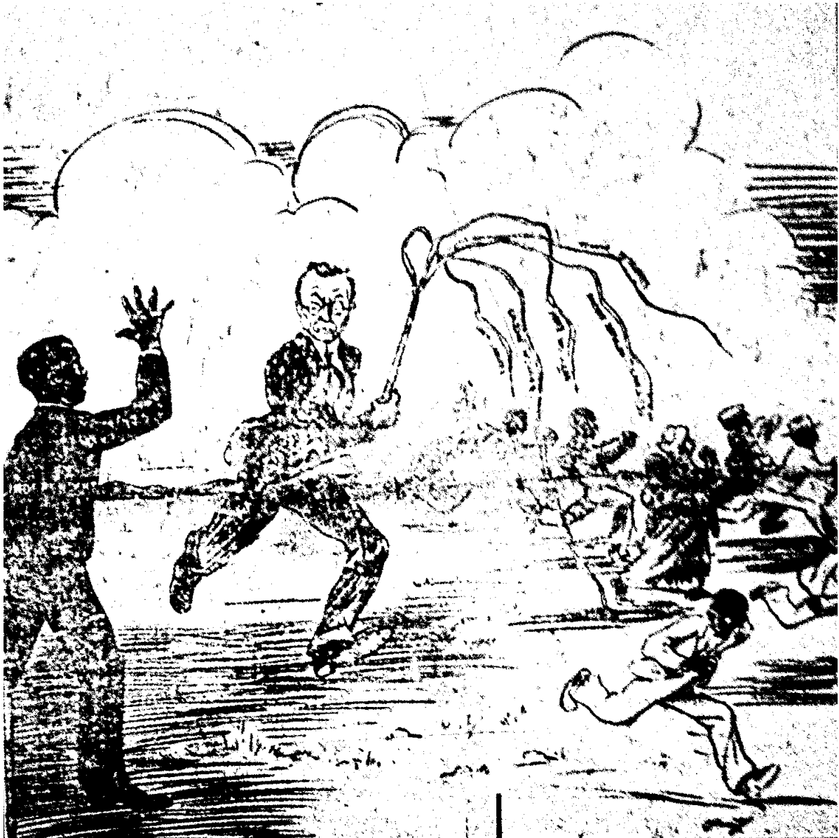
J.S. Scott, 'Nationalist Victory as seen through African Proletarian Political Eyes', New Africa , 29/06/1929.