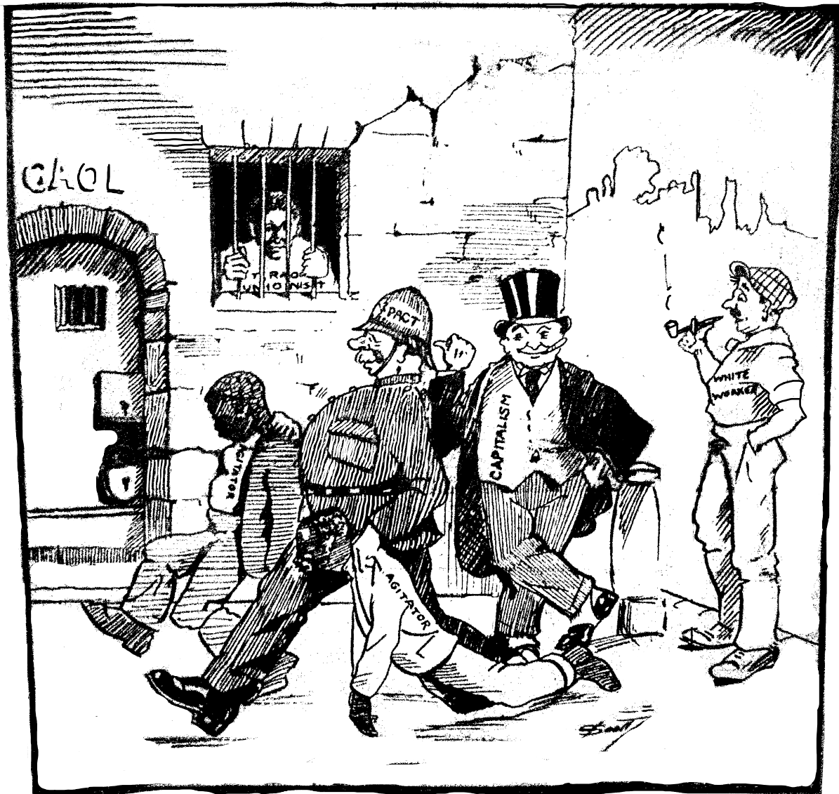
J.S. Scott, 'African trade unionism undergoing persecution under the Nationalist Labour government', Workers' Herald , 14/08/1926