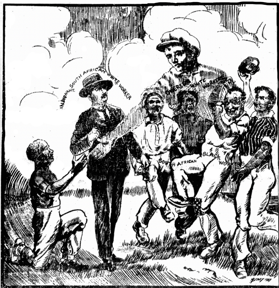
J.S. Scott, 'The African workers receive international recognition through the affiliation of the ICU to the International Federation of Trade Unions: The South African white worker is annoyed at the victory of the blacks', Workers' Herald , 18/03/1927.