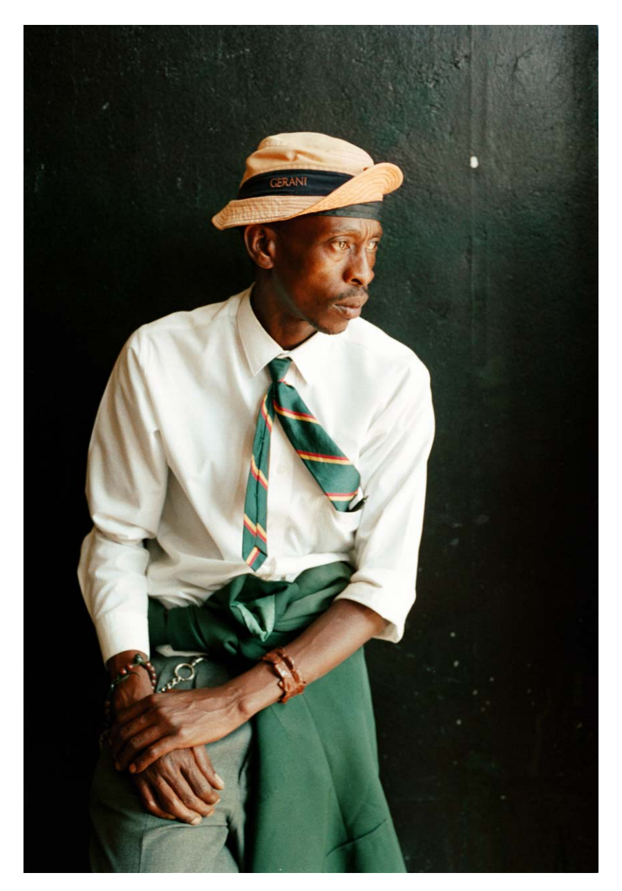
Figure 4. Yeoville, an inner city suburb that has been at the forefront of transformation to a truly African demographic residential area. Johannesburg. 2003 © Cedric Nunn.

Sean Jacobs: And this is the poignancy you convey in many of your photographs – an acute sense of what the body struggles to achieve, to aspire to, confronted by the circumstances that limit these aspirations?