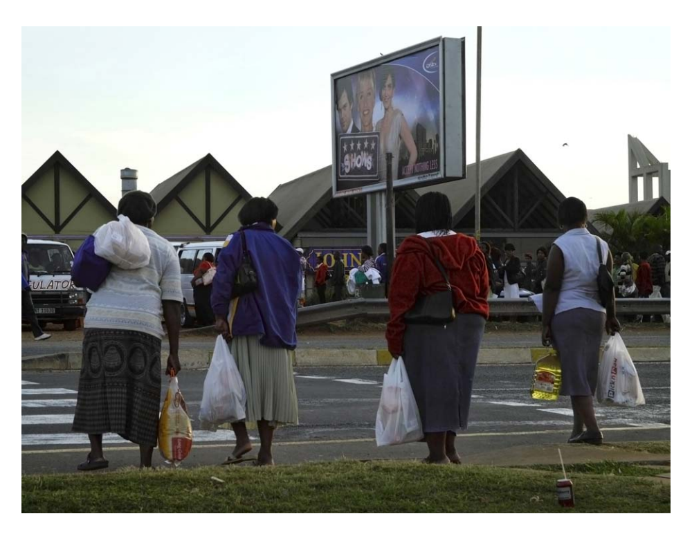
Figure 3. Workers converge on the taxi rank for their commute home. Ballito, KwaZulu Natal, 2009.

Sean Jacobs: There's a similar configuration of comments and analysis around body image, the corporate world and commodity consumption, it seems, in the photograph (Figure 3) of the workers approaching a taxi rank.