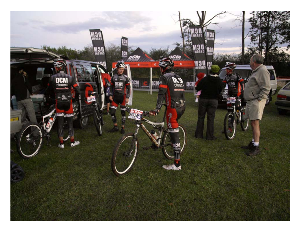
Figure 2. Sport and recreation activities such as these, sponsored by corporates such as Mr. Price in this instance, largely exclude the majority by the costs associated with entering and maintaining the activity. Karkloof Bike Challenge, KwaZulu Natal 2009.

country where whites are less than 10% of the population. Yet this is also true for leisure in general in South Africa?