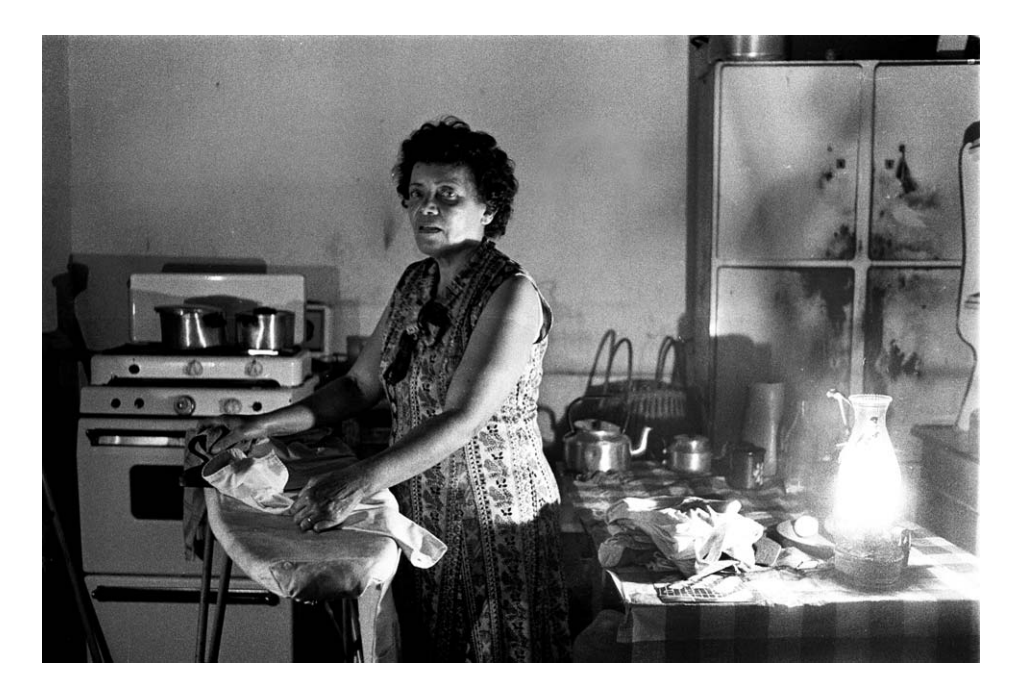
Figure 5. Blood Relatives.

improve. Mother was born in the heart of Zululand in 1924, and until she began school at the age of about ten, she spoke mainly Zulu. She attended a missionary run school for orphans in Durban, about 350 km from her home, going home once a year for holidays. Her only formal job was as a domestic servant for wealthy whites in Durban.