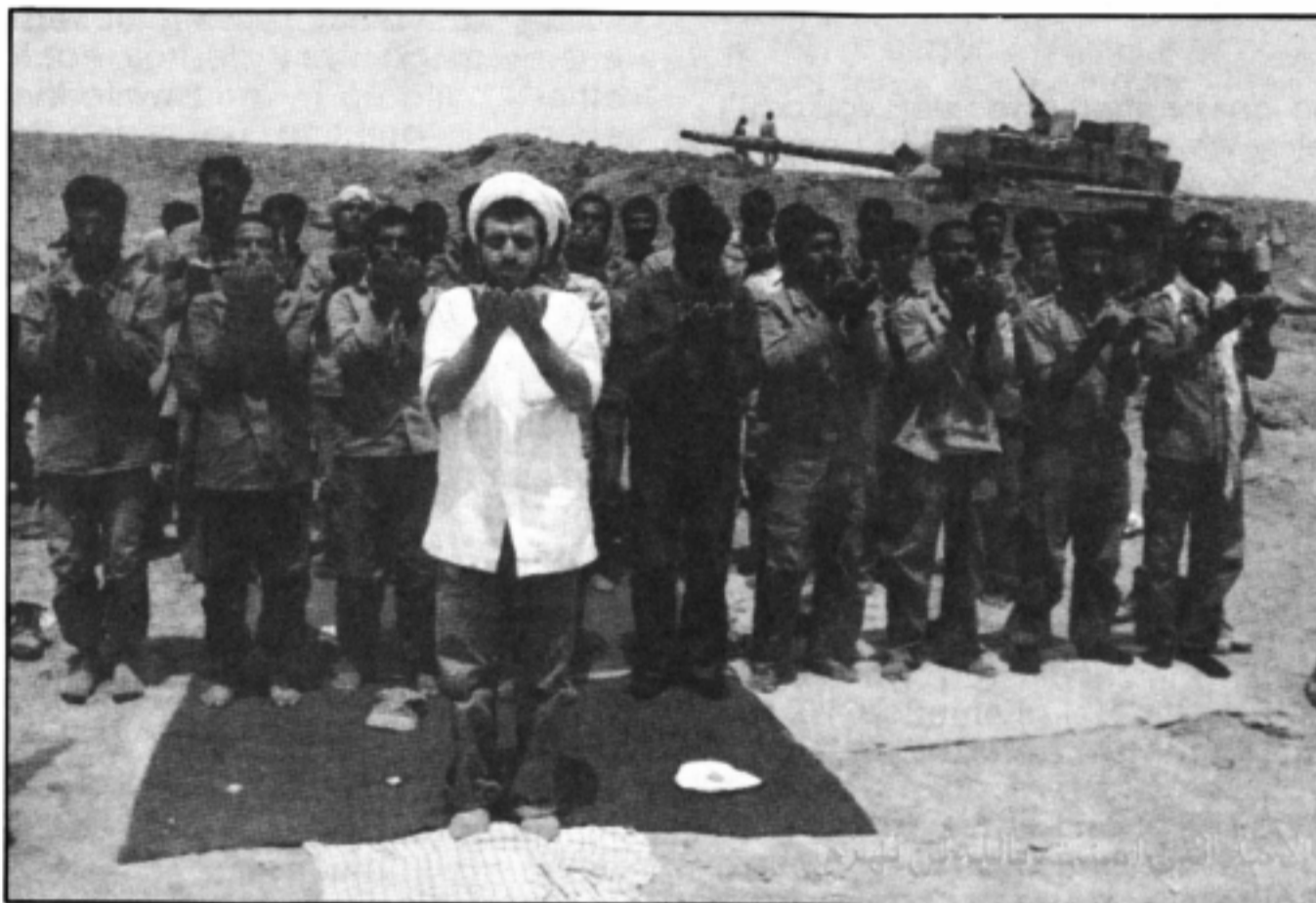
Iran . . . Salaat and Jihad are integral to Islam.

Solidarity! Solidarity, this is what we want. Solidarity among Muslims, solidarity among the Arabs, solidarity among the Asians, solidarity among the oppressed in Central and South America. "But what about