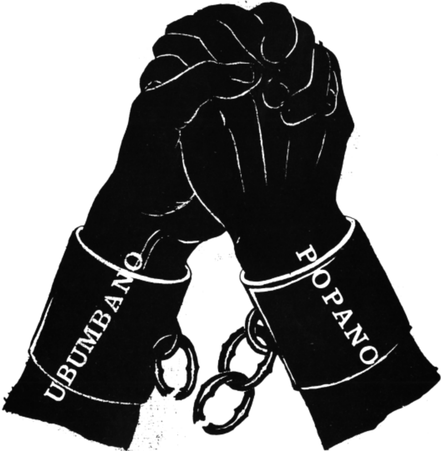
1983 Theme: Mobilise and Consolidate the Liberatory Efforts of the Oppressed Masses

find the path of solidarity. Gaddafi has risen up, many don't like him. "What you don't like about him?" "Well . . . he's a terrorist." "Who said so?" "Well . . . our Government." Your Government is the b-i-g-g-e-s-t l-i-a-r that is on the face of the earth. Your Government . . . Oh my God, Farrakhan, Is there nothing sacred to you, Farrakhan? Yeh, you're a bunch of liars. And you know it and I know it, the Bible teaches it and the Holy Quran too and I'm gonna preach everything that's in the Book for you and against you but most in the book is against you. Liars! Thieves! Murderers! Muslims, Muslims, Muslims, you must find the path of solidarity, it is the key to the Arab world's and the Muslim world's survival. That is a fact, Gaddafi is not an evil man, Gaddafi is committed to the masses who are struggling for justice, to the popular liberation struggles anywhere in the world and he is not selfish, he is willing to use the wealth of the Libyan people and share it with those who are struggling to throw off the shackles of imperialist adventurism, the blood suckers of the poor. The reason they call him a terrorist is because he frightens them, because they don't understand how his mind works. See a true Muslim revolutionary is one that the world don't understand. The world didn't understand Jesus, see Jesus was no milk-toast, punkified man, Jesus was a committed revolutionary who knew how to live and die for what he believed in. Understand this brothers and sisters.