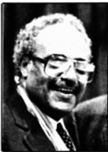
Benjamin L. Hooks