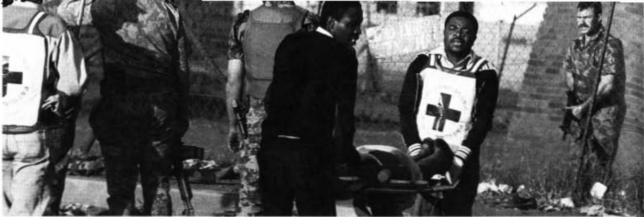
WAR ZONE: Medics carry a victim to safety in Tokoza.