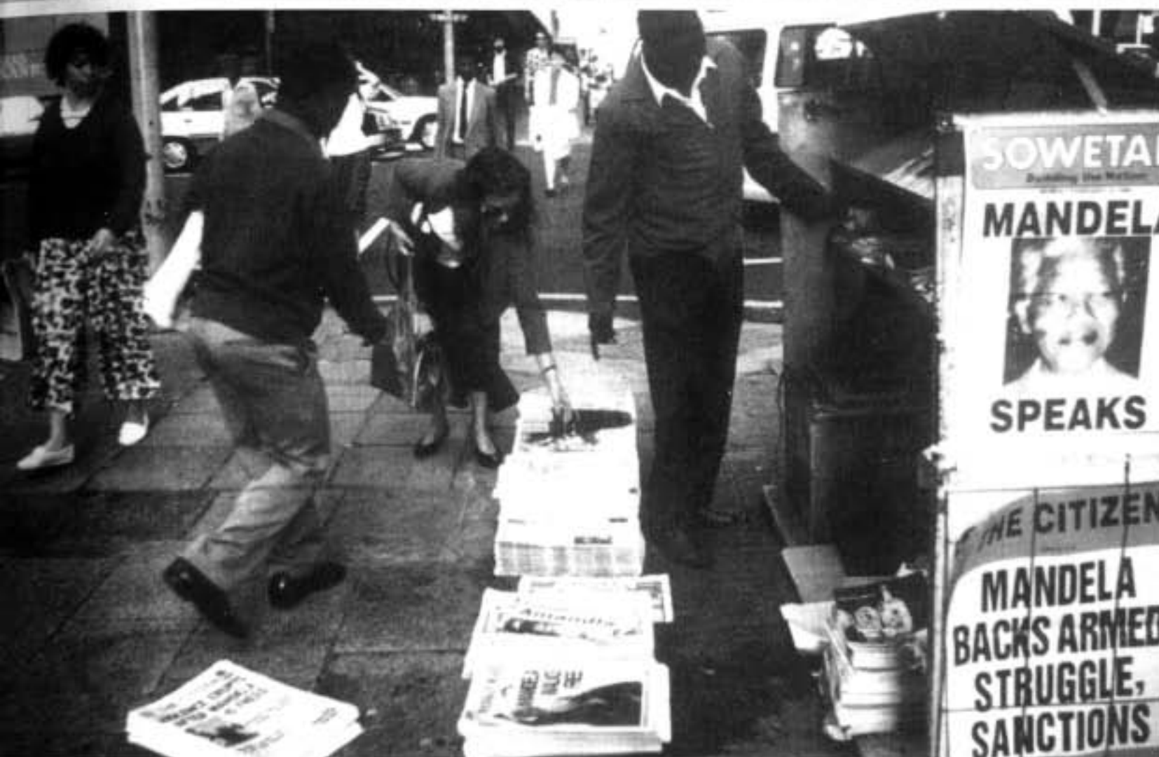
MIRRORS OF SOCIETY: No place to teach tolerance?