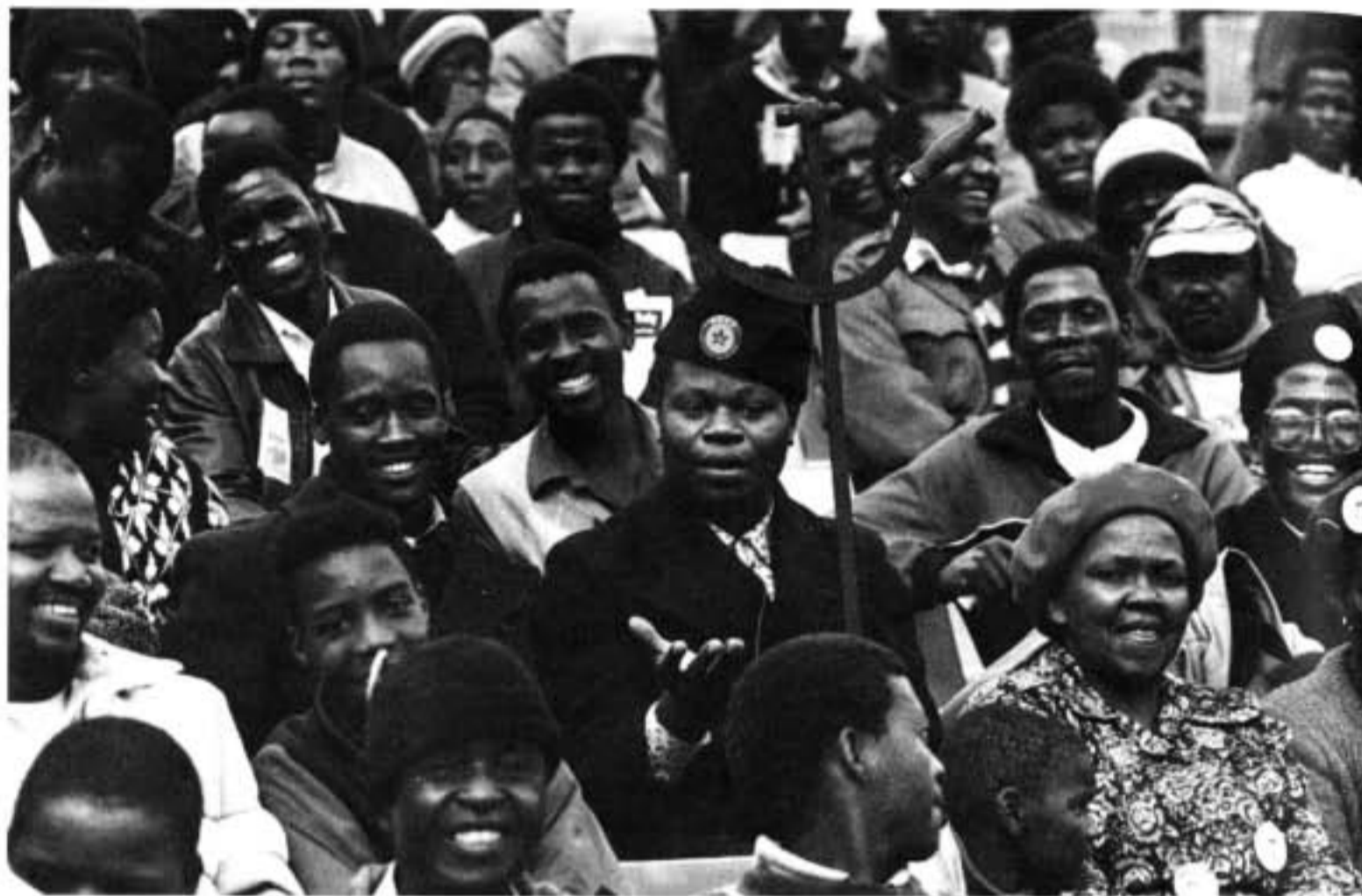
LEFTIST RHETORIC: Creating a groundswell of grassroots disillusion.