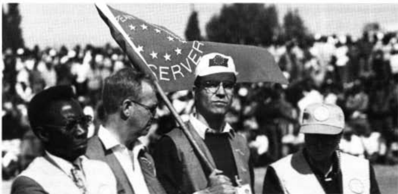
TOO WHITE? Monitors at work in Tokoza.

Sobantu Xayiya is a freelance journalist based in Cape Town.