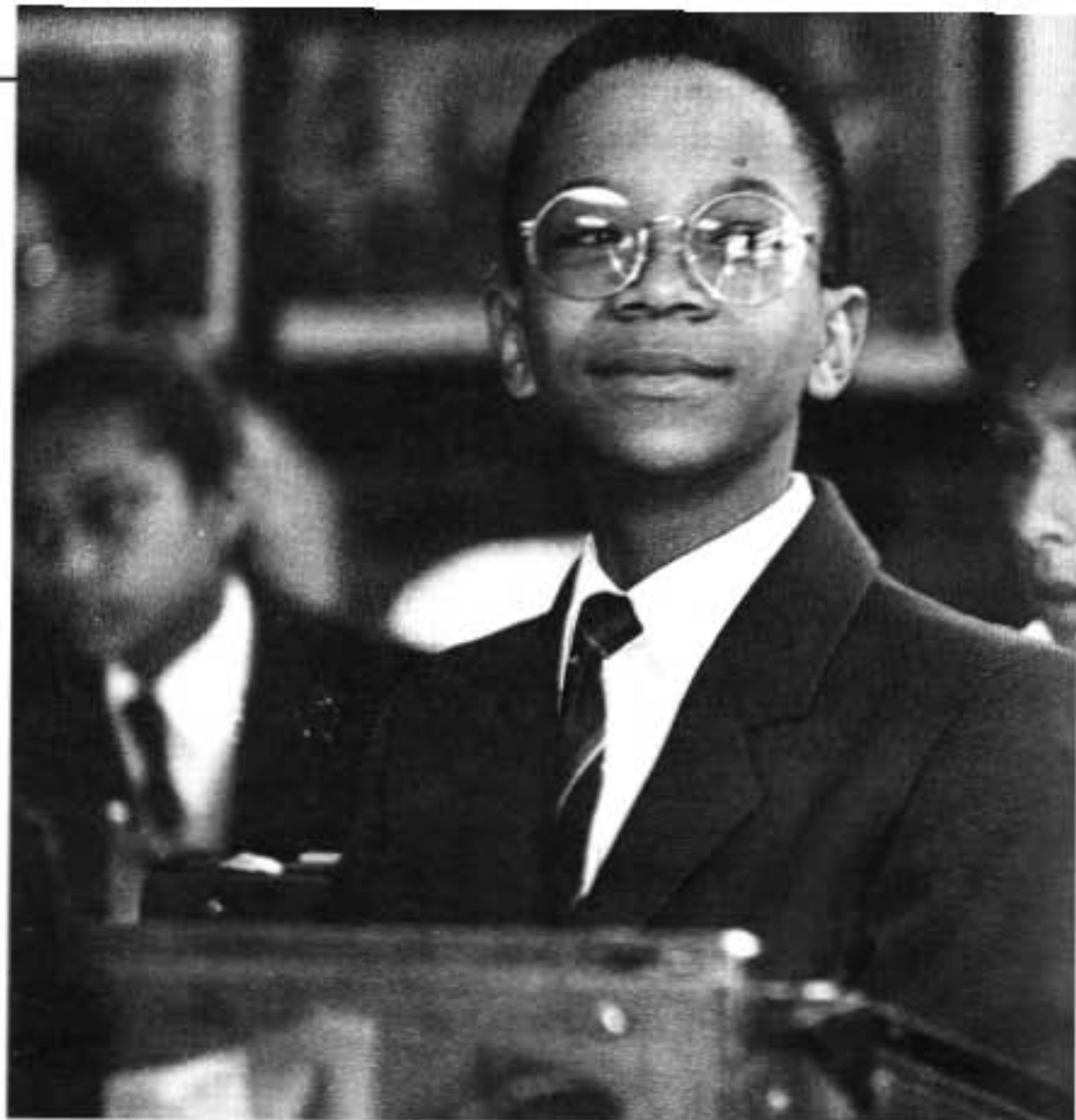
Research now shows that second language development goes hand in hand with first language development.

Old assumptions about language use and learning languages are proving to be somewhat off the mark in our changing classrooms. RUTH VERSFELD makes a few observations.