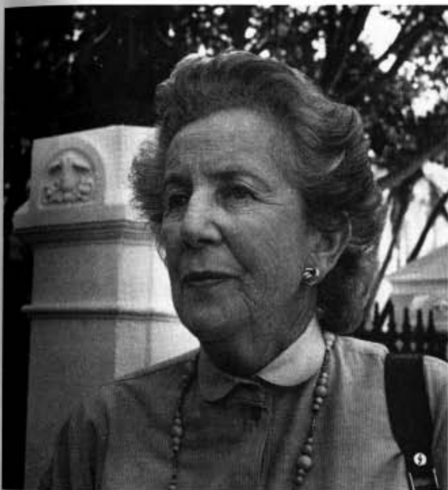
LIBERAL STALWART HELEN SUZMAN: Liberalism an uneasy perch?

It does offer an "ideology" (or non-ideology, rather) that is frankly pragmatic and non-partisan, which works on the basis of