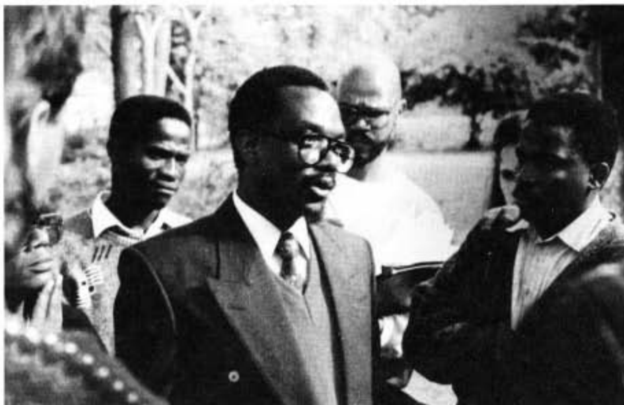
ZIMBABWE: Students are briefed by a staff member of the Cold Comfort Farm near Harare.

At a meeting with the University of Zimbabwe SRC, we learnt that Zimbabwe