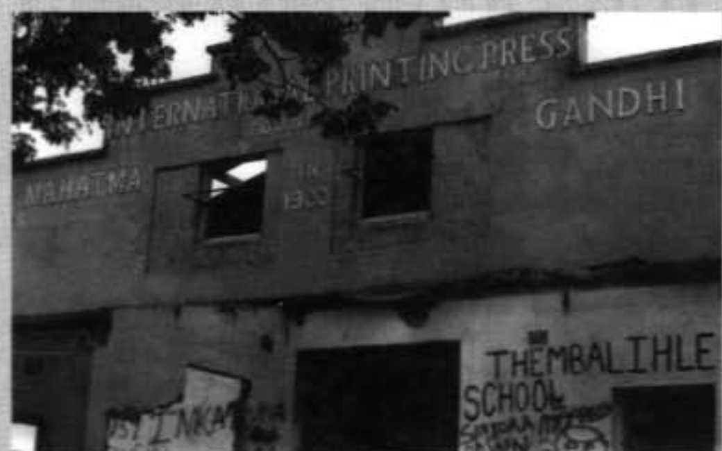
Once a printing press established by Gandhi, now a ruin in the Natal violence.

Gandhi's house was torn apart. Made from corrugated