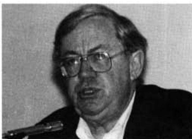
SPARKS: avoid “simplistic” journalism.

He warned that in its present state, South African journalism was not well placed to provide sensitive, in-depth reporting. He said it seemed that the stock headlines used to describe the complex process of the negotiations process at the World Trade