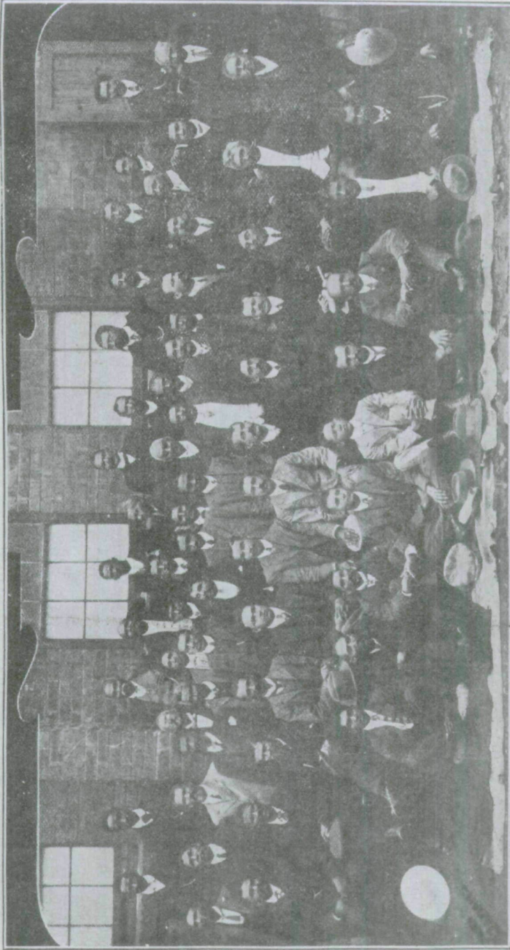
The Ninth Annual Conference of the A.P.O. held at Johannesburg in 1912. National Library of South Africa, APO Album III, INIL 11816.