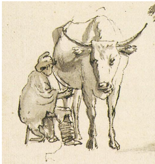
Figure 3: Late 17 th century drawing of a Khoe woman milking (from: Smith & Pheiffer 1993: Plate 16).