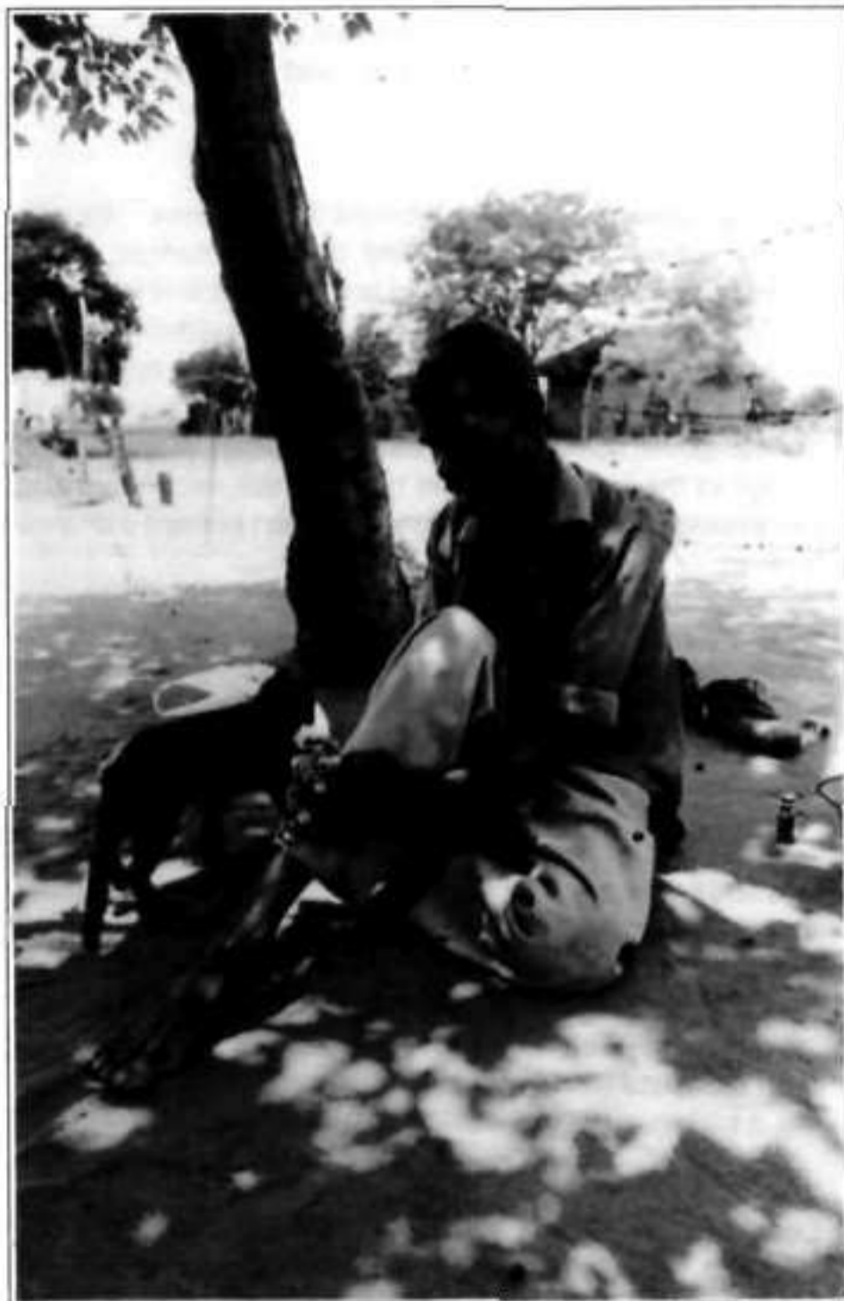
Even old people have been attacked by vigilantes

The area is excessively bleak at a time when rains have been good. Given a year or two of drought and existence there becomes unthinkable. Predictable consequences include malnutrition and high infant mortality — for starters.