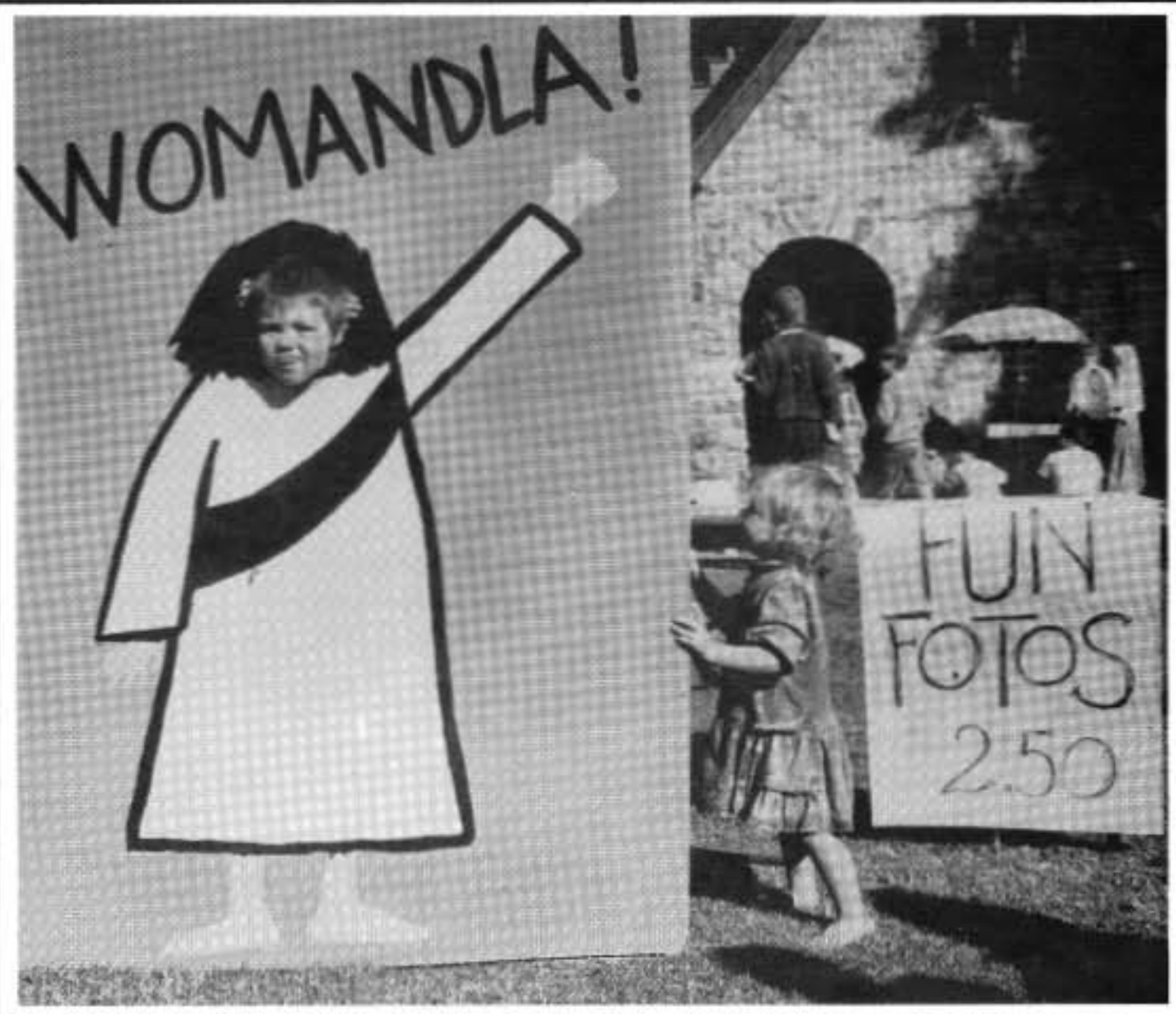
Here's something different! Children have fun at the Five Freedoms Forum Open Day in Johannesburg on 31 May.

Tartrazine is a food colouring. It also adds flavour to food. It is used in many yellow- coloured foods. It is banned all over the world because it is bad for people's health. Things like cheese and onion chips, fanta, niknaks and most chocolates and sweets have tartrazine in them. If some food has tartrazine in it, the company must say so on the packet. So look out for it!