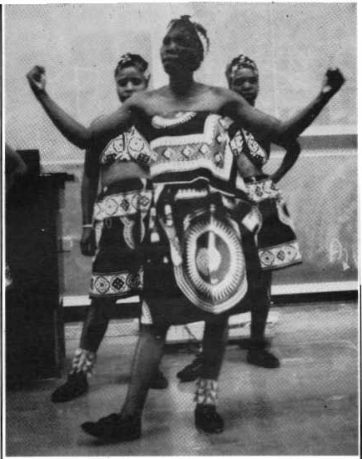
The SRC at the University of Durban Westville have just launched a women's group. They invited the Mpophomeni Women Dancers to perform their dances as part of the celebrations. Everybody thought they were wonderful. Our photo shows the dancers in action!

But pupils expelled for pregnancies are now given a second chance. Both schoolgirls and schoolboys who have been expelled for this reason can apply to come back to another school. The schoolgirls can apply to another school a year after her baby is born. The education minister said, "We don't think you should be condemned for life, instead you should be given one more chance."