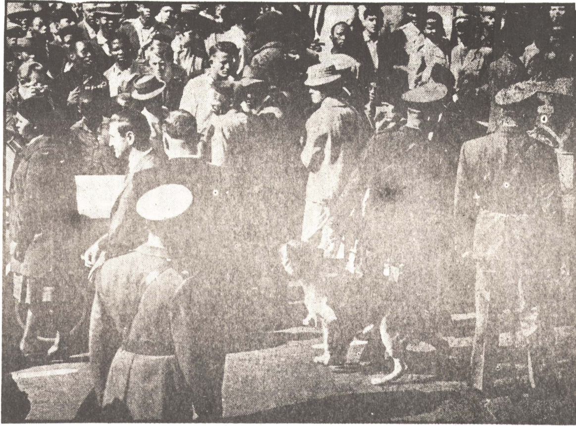
Traffic officers, plain-clothes men, policeman and police dog, move some of the crowd of about 1,000 people who gathered outside the Palace of Justice for the Rivonia trial sentences on to the pavement yesterday. The crowd continually moved into the road, and police were forced to order them back to allow traffic to pass.