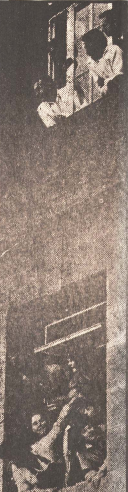
Postal workers lean out of the windows of the post office overlooking Church Square to get a view of the crowd waiting for the sentences in the trial.