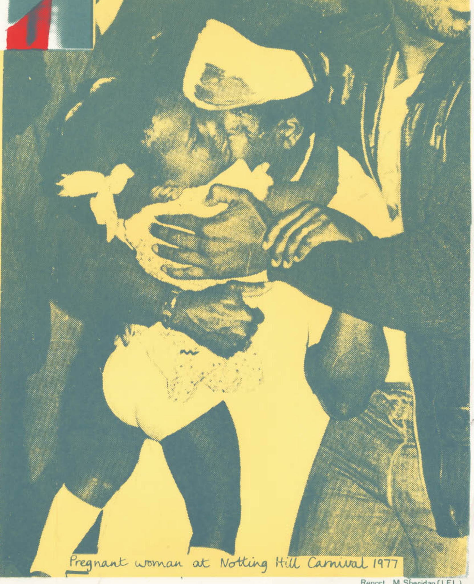
Pregnant woman at Notting Hill Carnival 1977