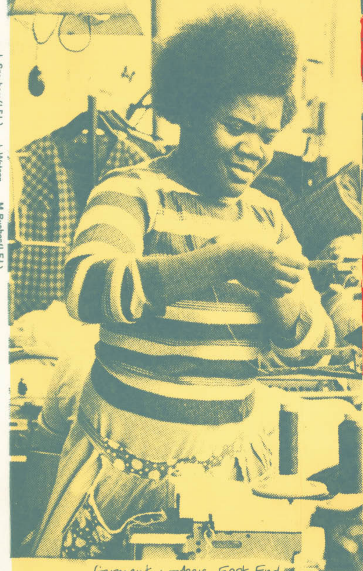
Garment worker, East End