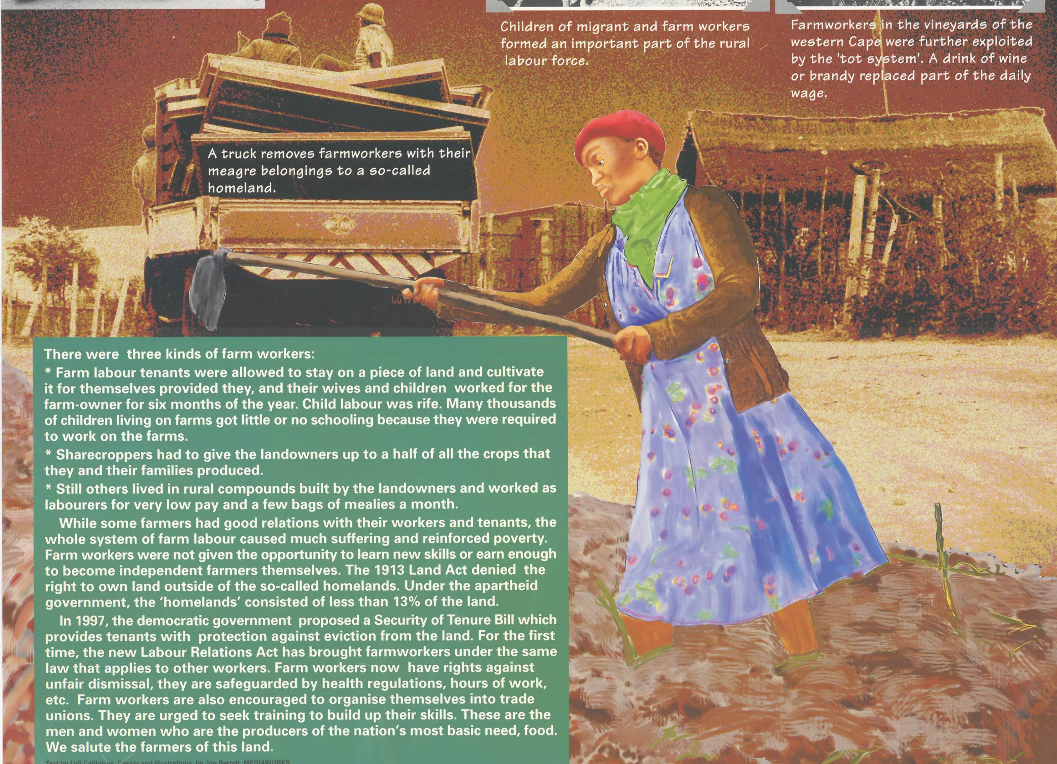
A truck removes farmworkers with their meagre belongings to a so-called homeland.