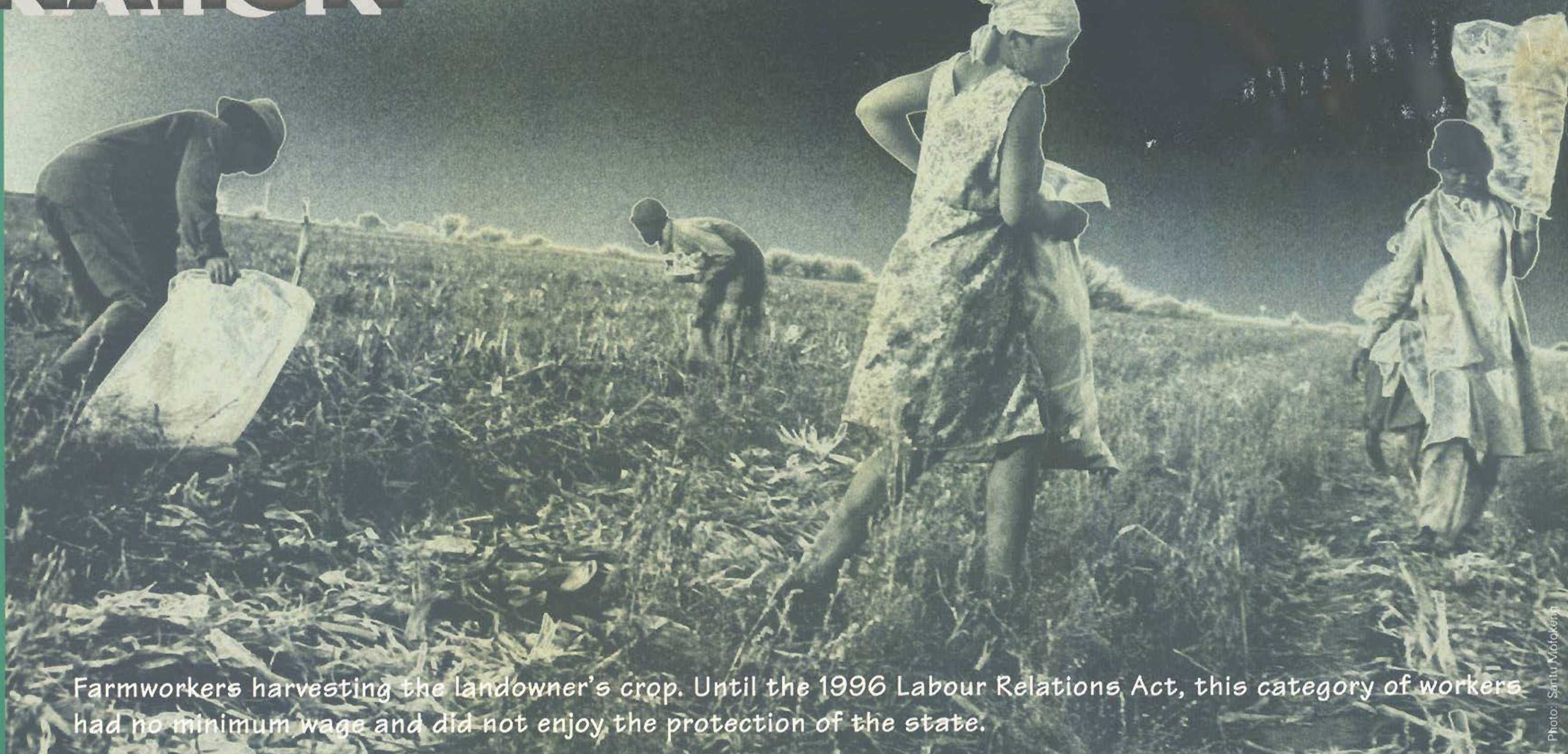
Farmworkers harvesting the landowner's crop. Until the 1996 Labour Relations Act, this category of workers had no minimum wage and did not enjoy the protection of the state.

Nearly a million workers in South Africa are based on white-owned farms. They are descendants of those who fought for many years but lost their land during the nineteenth century. This land was taken over by whites, who eventually became commercial farmers.