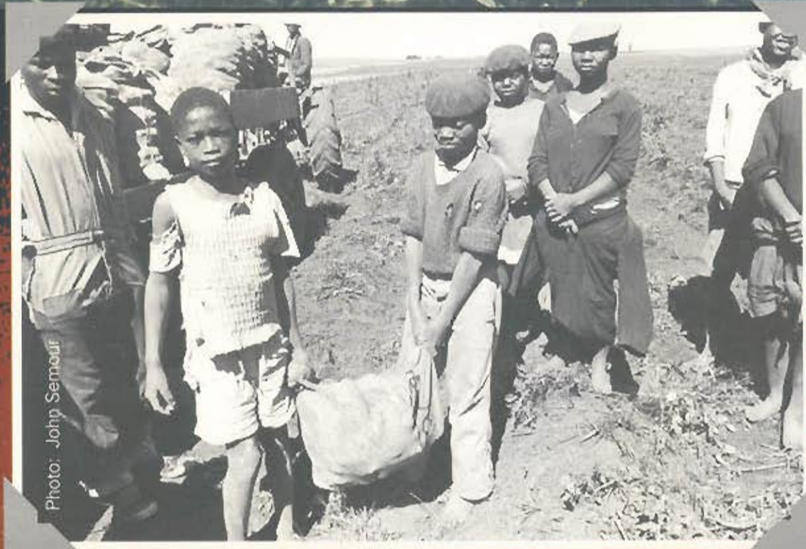
Children of migrant and farm workers formed an important part of the rural labour force.