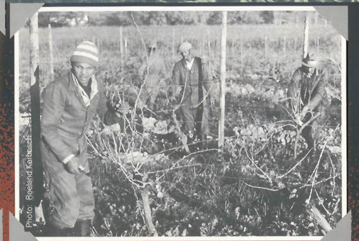
Farmworkers in the vineyards of the western Cape were further exploited by the 'tot system'. A drink of wine or brandy replaced part of the daily wage.