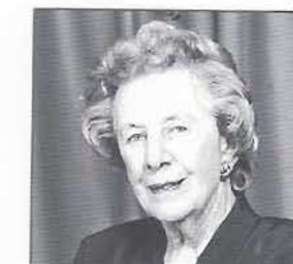
Dr Helen Suzman