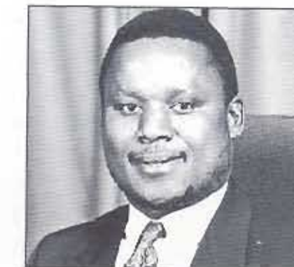
Rev Frank Chikane