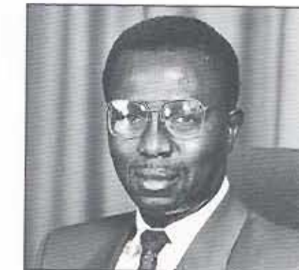
Advocate Dikgang Moseneke SC (Vice-Chairman)