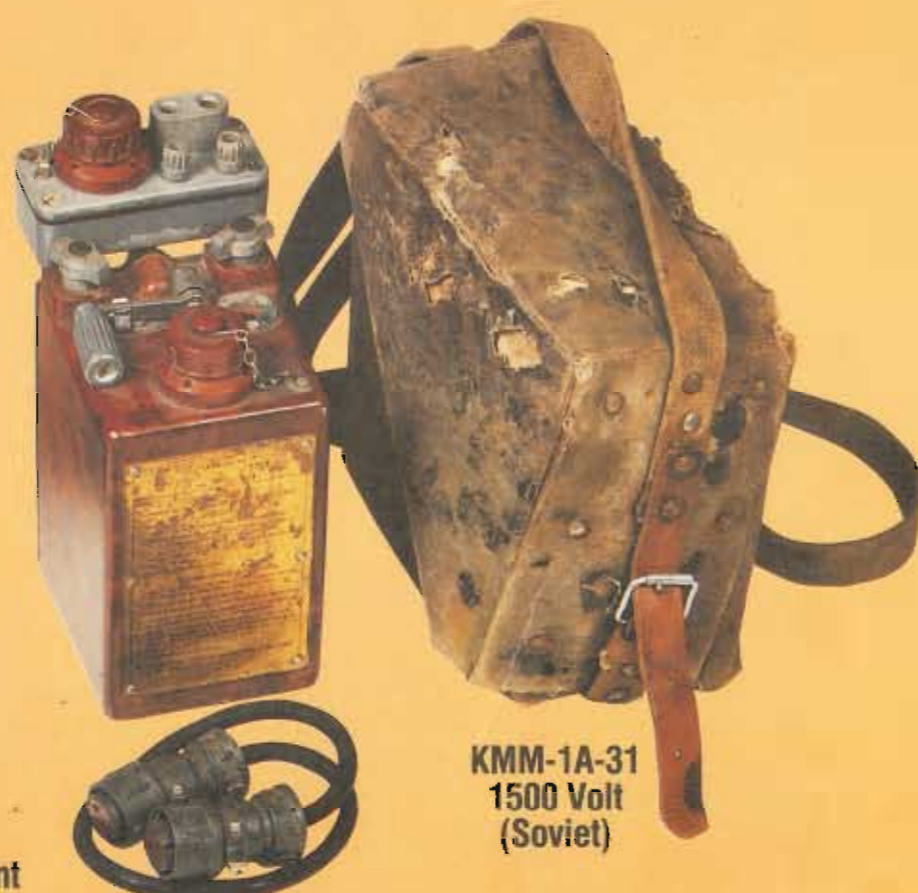
KMM-1A-31 1500 Volt (Soviet)