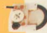
Electronic switch for letter bombs