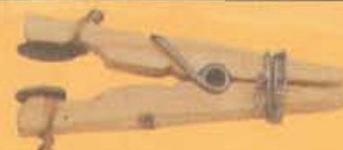
Home made timer - clothes peg & lead solder