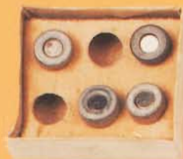
MD6 detonators and container