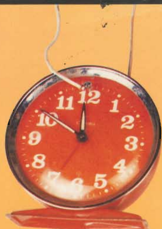
Improved clock & watch timers fitted with electrical leads

This poster is the copyright of the promoters. Any infringement will result in litigation.