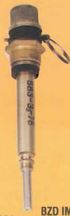
BZD IM Igniter with detonator (Soviet)