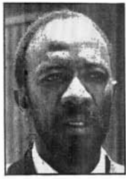
Messrs. Tom Nkobi (left) and Alfred Nzo, who, with Mr. Macdonald Maseko, have been placed under 24-hour house arrest. (See story on page 4)