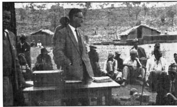
GOVERNMENT THREATS: Government promises and more promises, but only if the people accept Bantu Authorities. This was the ultimatum delivered by the Bantu Commissioner from Nebo.