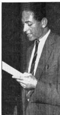
President: Mr. Dennis A. Brutus.