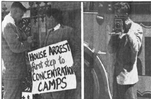
A Cape Town demonstration against house arrests earlier this month was broken up by the Special Branch after about 15 minutes. On the left a Special Branch man takes down the name of a demonstrator. On the right a police photographer takes a shot for the police files.