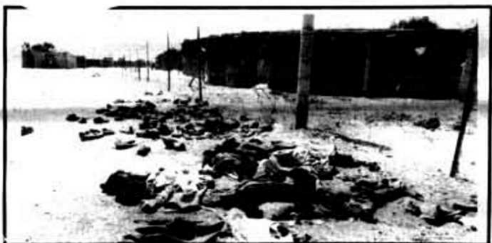
Death and destruction at Winterveld

"The shooting of the people was completely unprovoked", said Winterveld residents. "It was a gathering of mainly elderly men