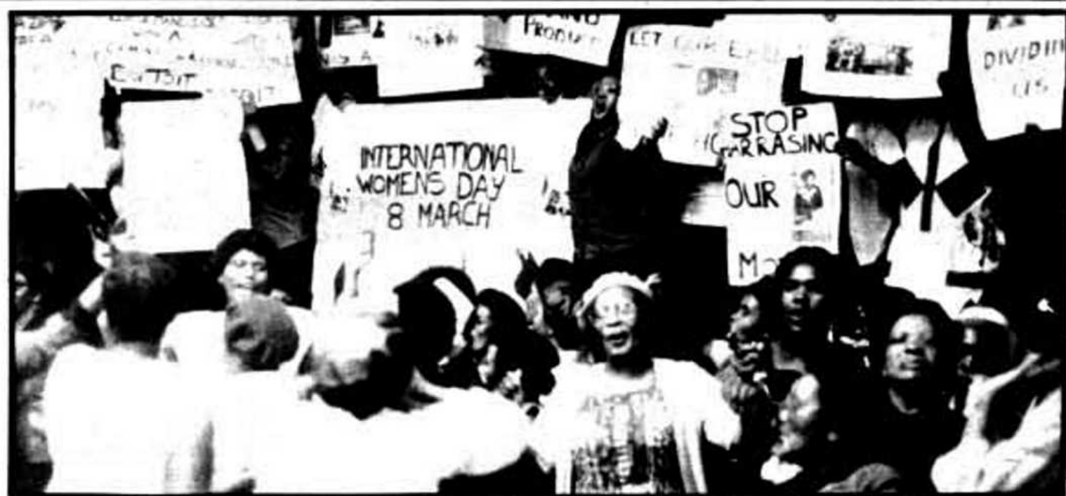
Part of the crowd came to celebrate International Women's Day in East London on March 8.

● The Cost of Living and Unemployment Campaign was seen as a result of the economic crisis. The two campaigns were initiated by Cosatu's Unemployed Workers' Union (Unewu). The AGM hoped Unewu would frustrate employers' attempts to break the workers' strike by building solidarity between workers.