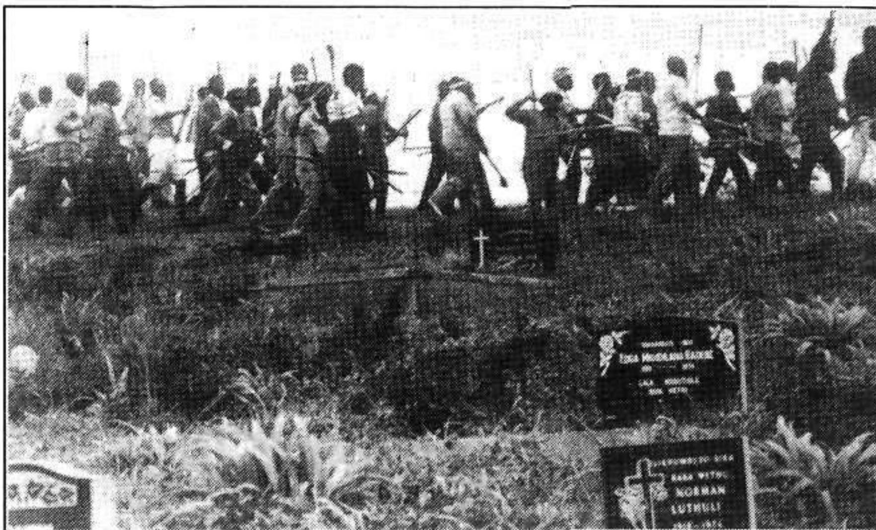
Inkatha supporters chasing mourners at the funeral of victims of an attack on the memorial service for Victoria Mxenge

charged and dispersed a crowd of about 2,500 that had tried to attack the shopping complex.