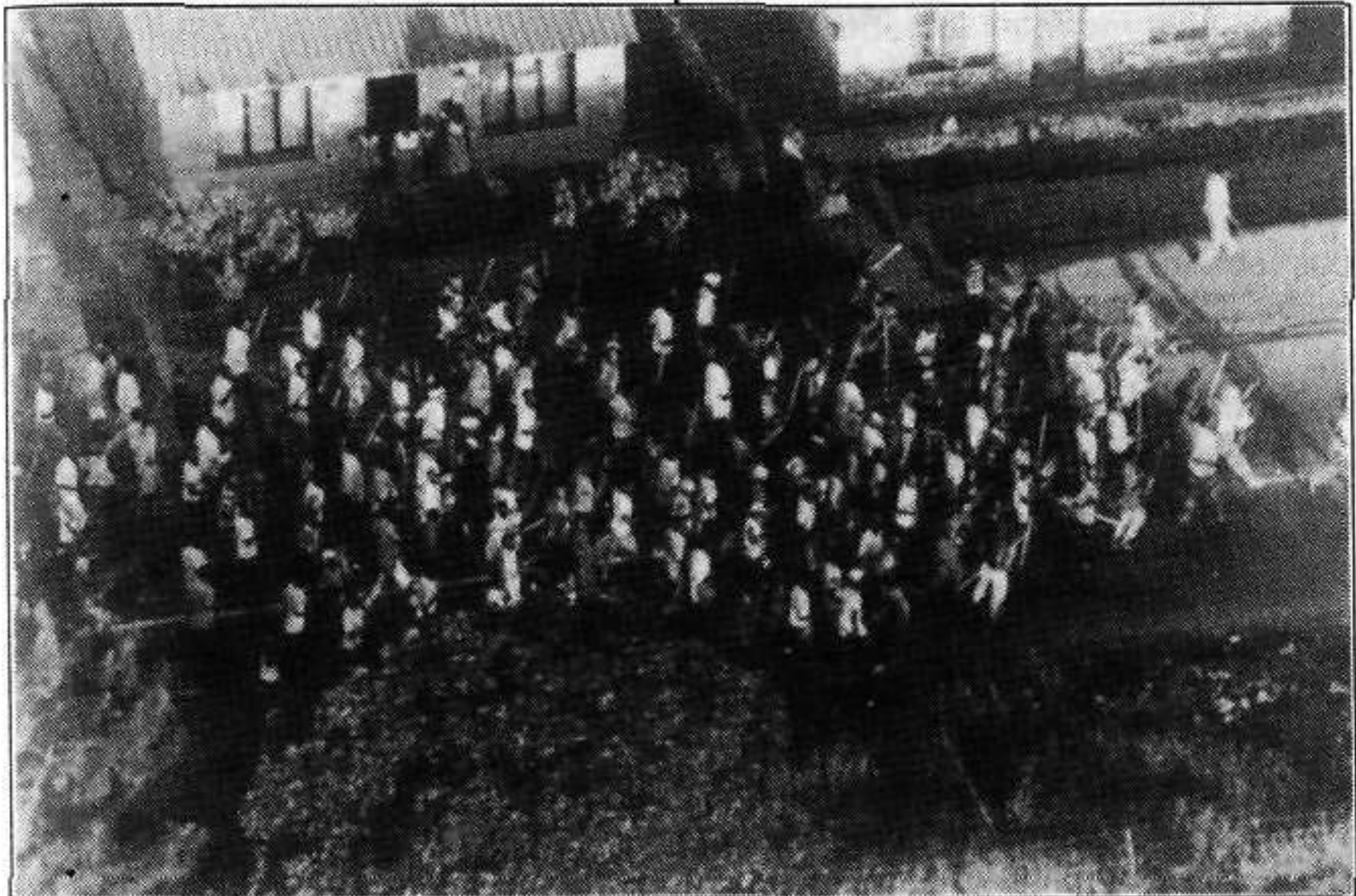
Amabutho on the move - KwaMashu

"I was forced to join the vigilantes. They went around beating people up after 8p.m. They came with a list and collected everyone after work. They held a roll call. If someone was not present they would go to him the next day and