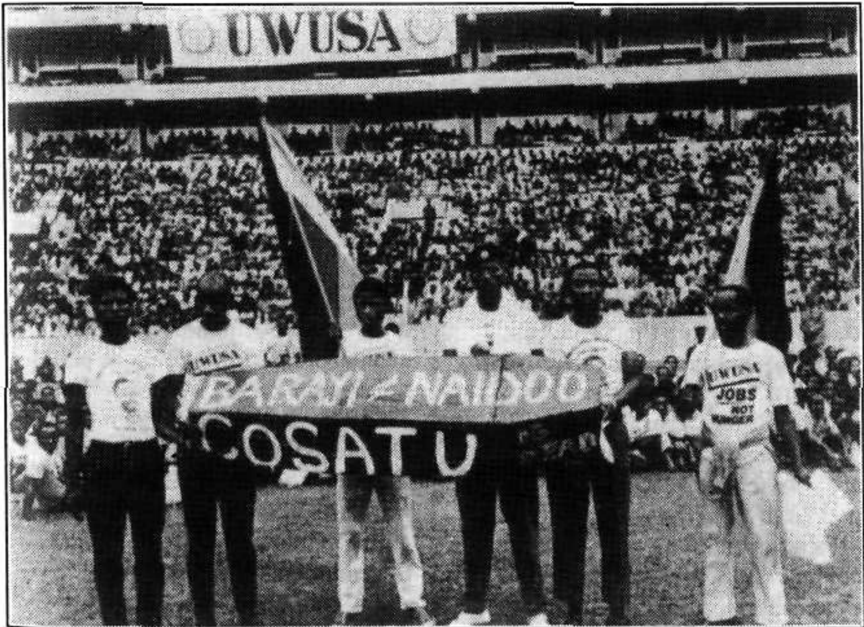
Uwusa launch - an attack on Cosatu

The conflict in the townships heightened as COSATU leadership came under attack from Inkatha supporters. These attacks took the form of attacks on persons as well as the burning down of homes. The attack on COSATU leadership continued, becoming most heightened in the Natal Midlands, and in Northern Natal through 1986 and continuing into 1987 and the present. Worker leaders lived in fear of their lives, some being forced to flee their homes as a result of threats from Inkatha supporters.