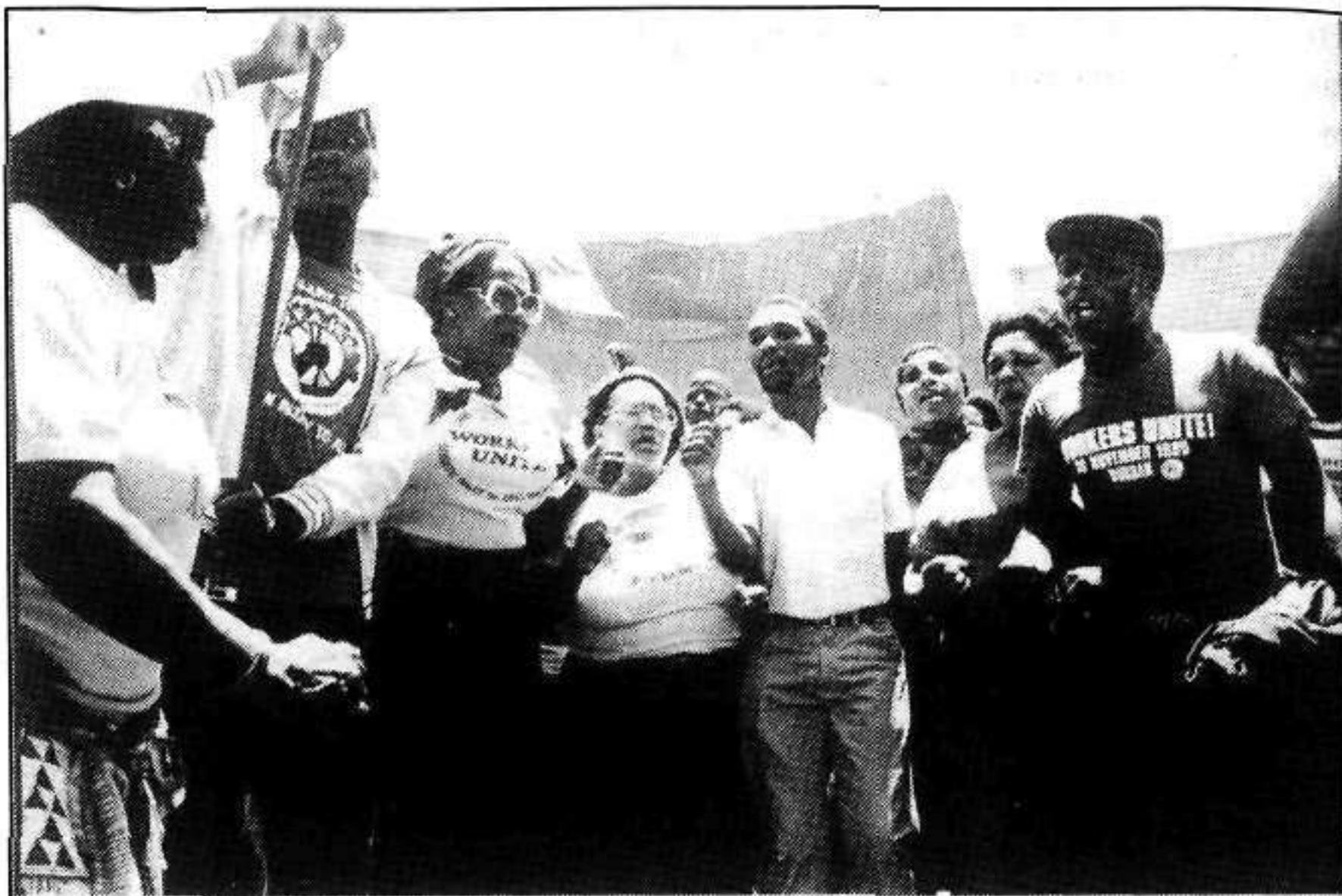
COSATU launch - a giant is born