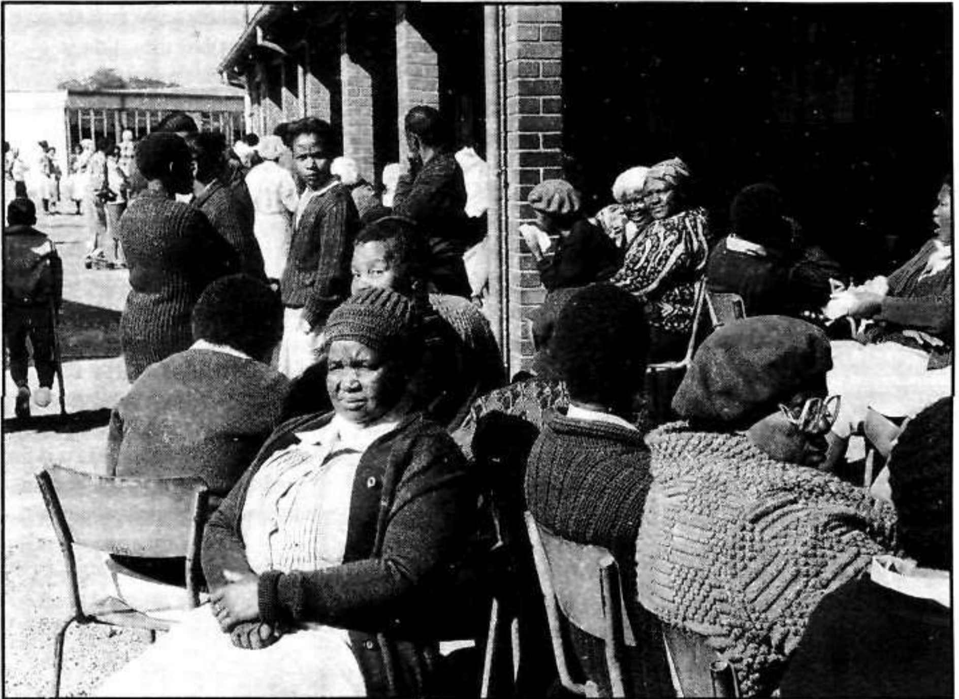
Workers sit out the strike at Baragwanath in defiance of a court interdict