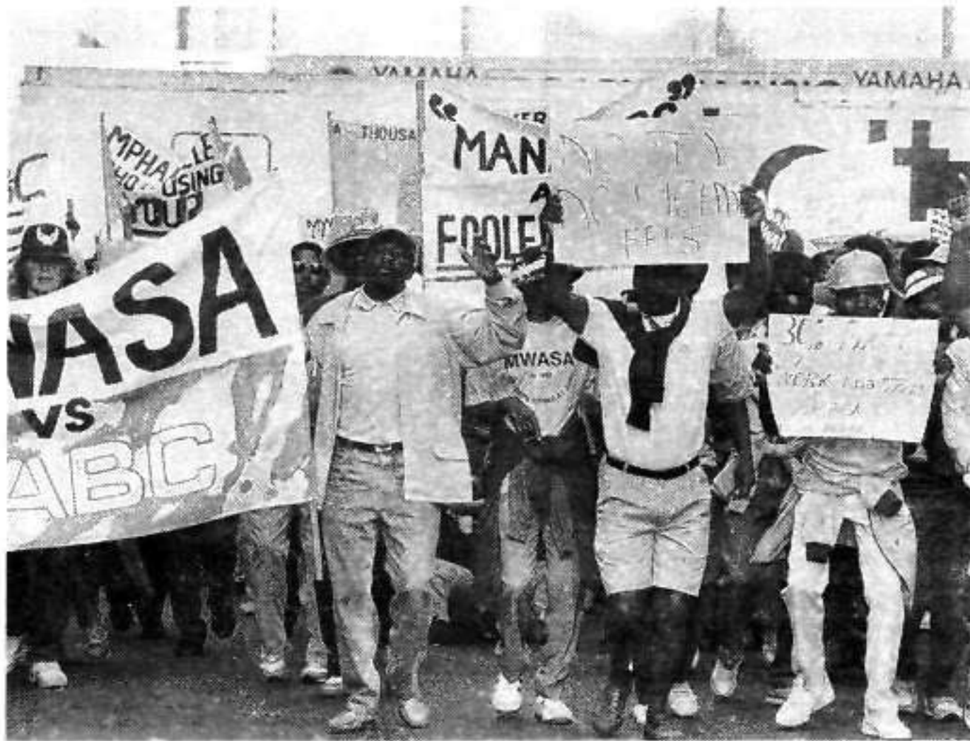
MWASA strikers on the march against the SABC