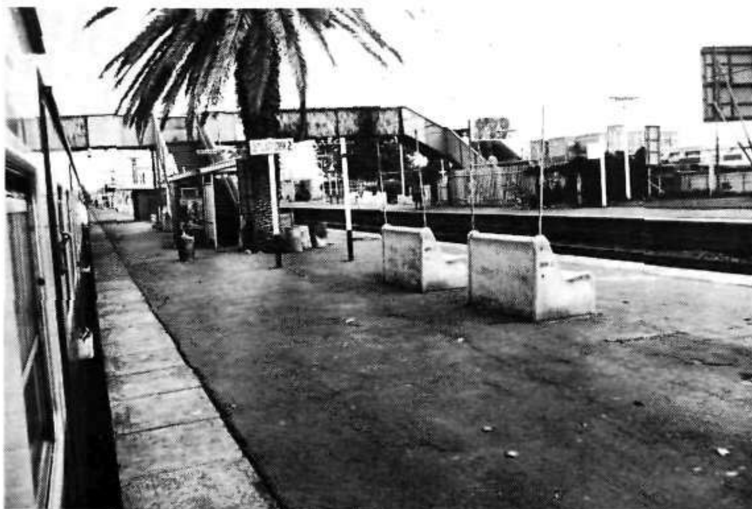
Train platforms usually packed with workers — silent on the morning of the stay-away

The massive support for the stay-away clearly shows the extent of the very real frustration of FOSATU members — a frustration, to which the government's only response was to detain worker leaders.