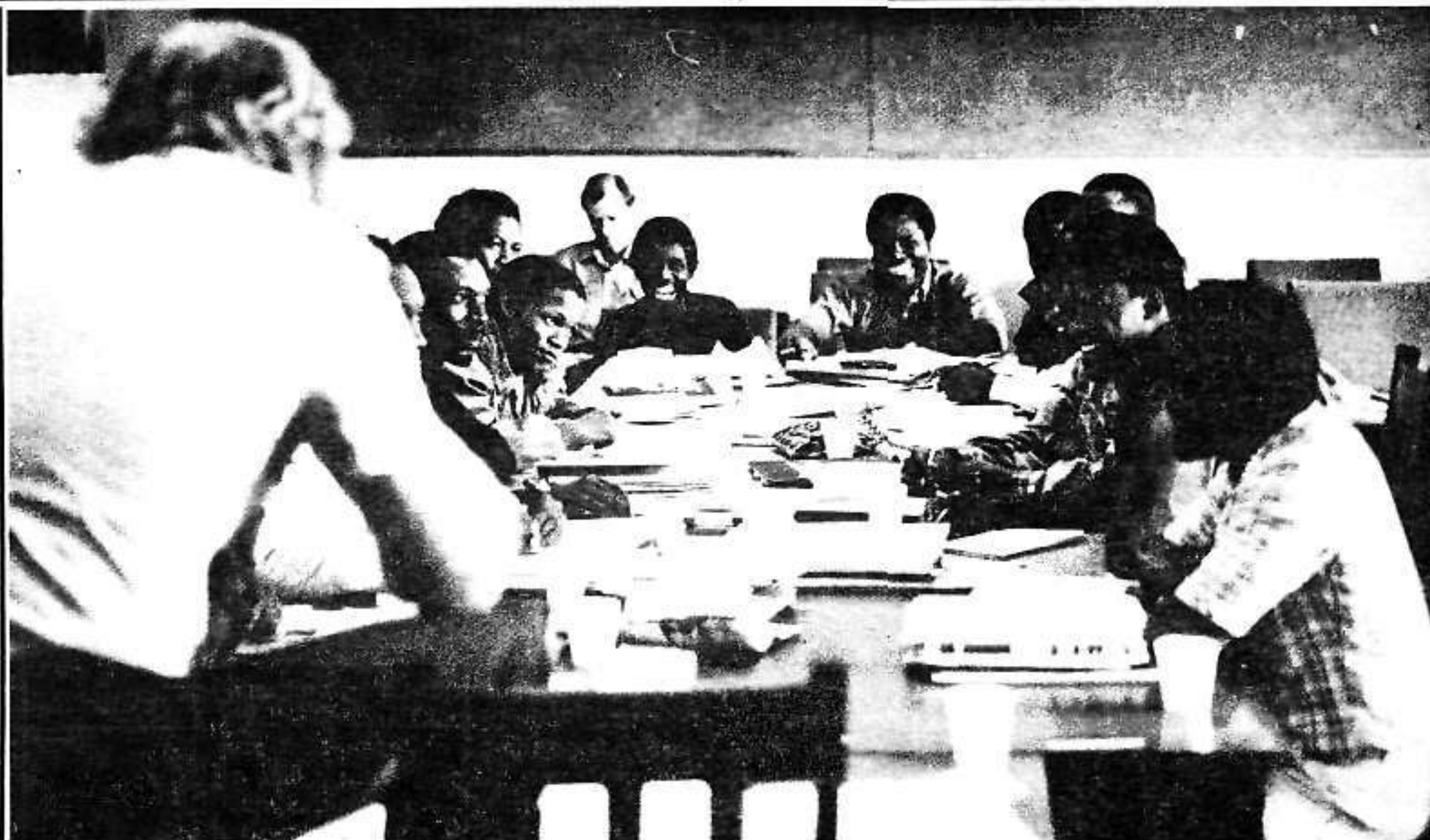
EVEN the worker struggle has its lighter moments - shop stewards and organisers at the last Labour Studies Course.

FULL PUBLIC PROGRAMME CARRIED ON NEXT PAGE