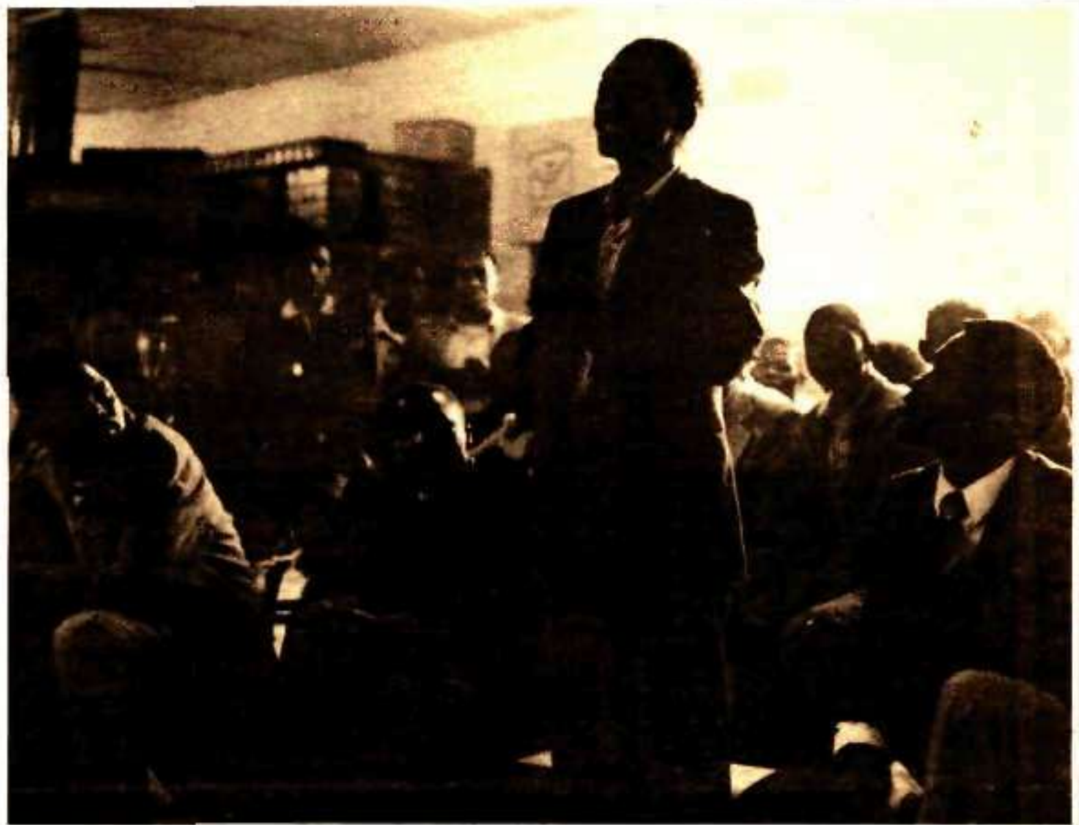
NATAL Thread workers discussing the finer details of the strike the day before it was due to begin.

FWN believes that Natal Thread's management will have to learn to respect workers' legitimate grievances the hard way.