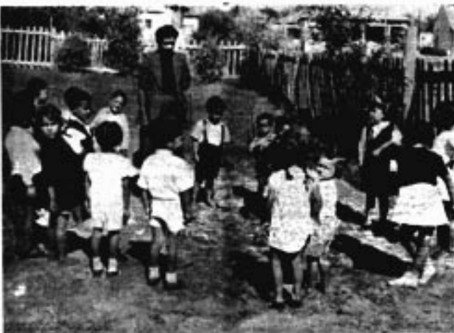
Children at play . . . what is their future?

And they go to school . . . shades of the prison house begin to close about the growing boy. What do you think about the schools there days? Of course, they don't beat the kids with birches and the children have dental clinics, school-feeding, usually airy classrooms and fine playgrounds. But what about the actual educational system? I think it's terrible. The system demands that each child shall finally have a lovely certificate to the effect that he knows who won the Seven Years' War, that x plus y squared equals x squared plus xy plus y squared, that the Great Trick took place in 1858, that 's' comes before 'c', except after 'c' . . . and all that. All this unnatural emphasis on intellectual learning, cramming, sweating, passing exams, failing exams, homework, detention and lines! One doesn't get a picture of a crowd of children happily DOING things, playing, make-believing, being wonderfully individual and