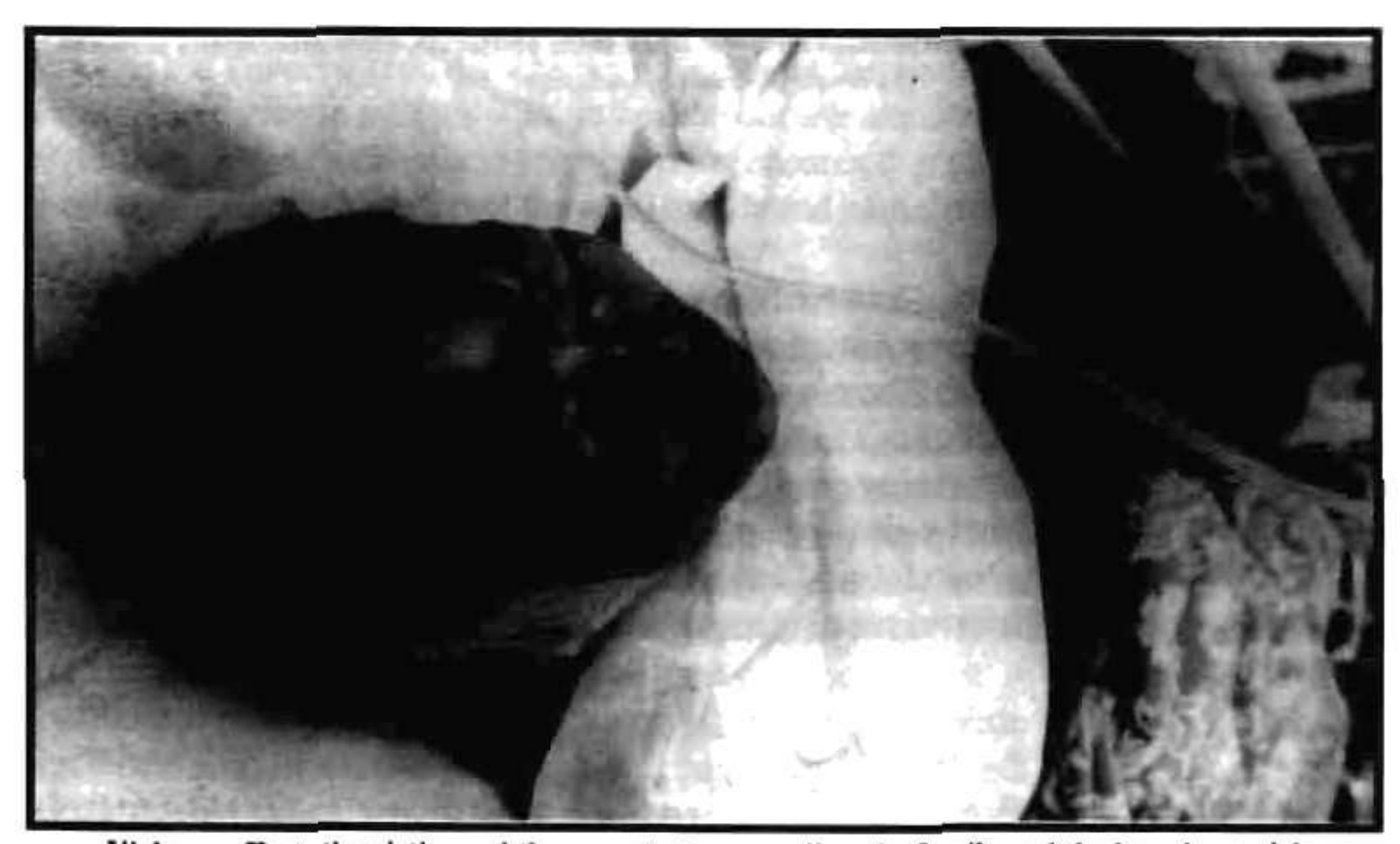
Violence affects the victim and the perpetrator, as well as the family and the broader social community.

This article, by members of the Health Psychology Unit at the University of South Africa, briefly examines trauma as a public health problem and explores possible explanations for violence. An approach to research into violence in South Africa is briefly described, where ways of bringing together theoretical knowledge and people's common sense ideas are explored.