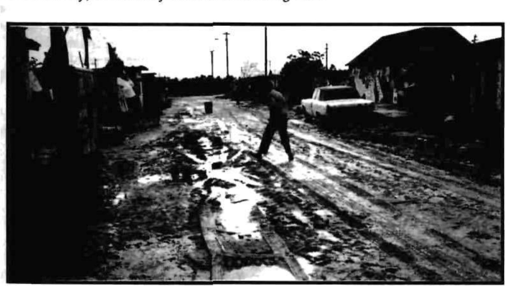
Research has pointed to a relationship between the living conditions of a community and the level of violence.

If the colonial model is true, one would expect violence to decrease in societies in which there is steady progress towards liberation, the achievement of equal dignity and respect for all, and the redistribution of resources so that they become available to all members of the society, and not only to those of the ruling class.