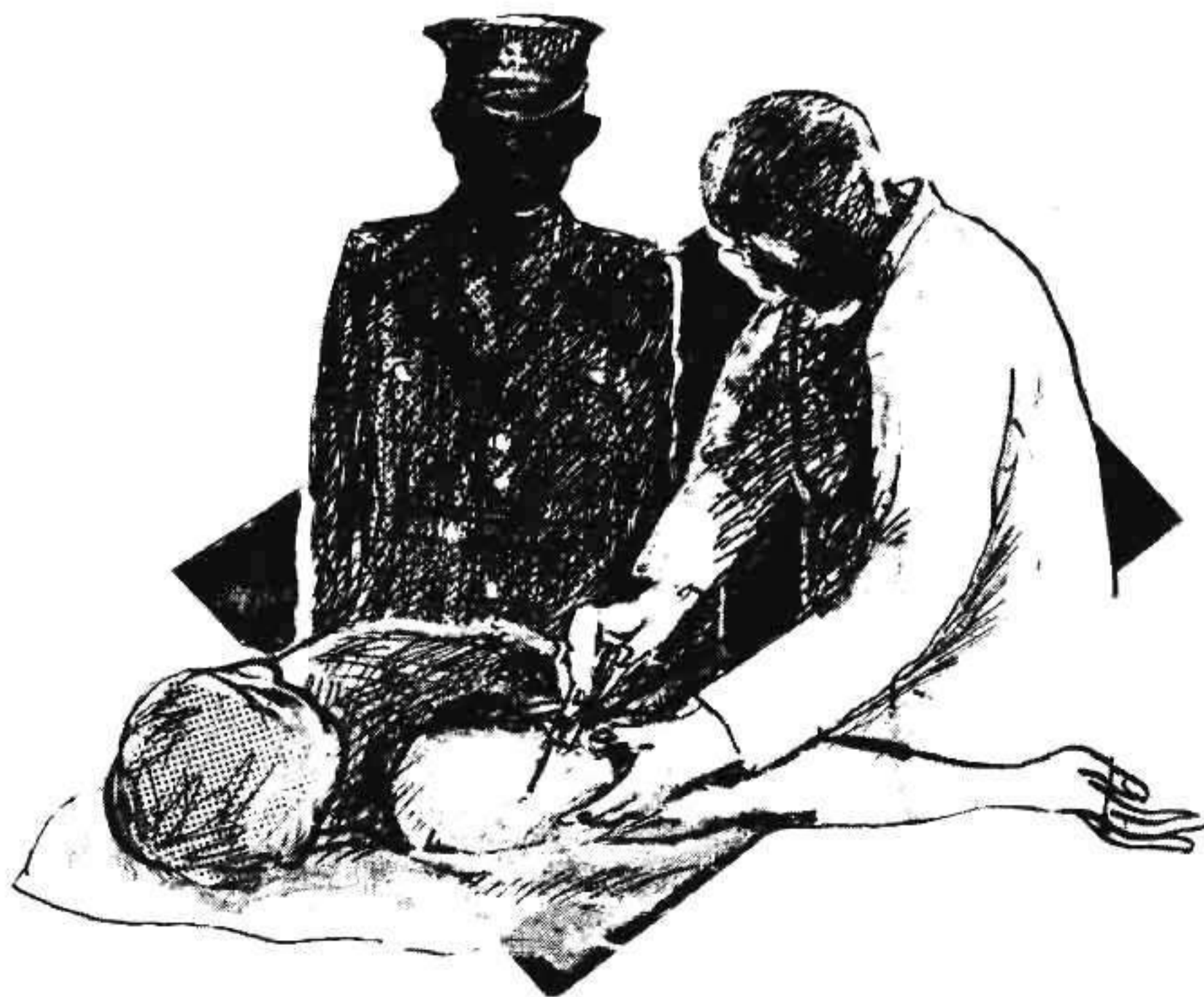
In some countries health workers have been accused of active participation in torture

Under the auspices of the Medical Action Group is the Philippines Action Concerning Torture grouping (PACT). This group provides a clinic for the physical and psychological examination and treatment of former detainees, many of whom have been tortured. Workers at the centre report that many of the people coming in to the centre say that what they need most is not so much physical and psychological help and "rehabilitation" but to be surrounded by supportive and caring political people. As one person using the centre put it, "I don't need a therapist, I need a collective". This shows that although many people released from detention may be suffering physical and psychological effects they should not be seen as "patients", but rather need a particular kind of caring within an environment which is supportive to them and to their cause. This is not to say that they do not want or need medical and psychological help,