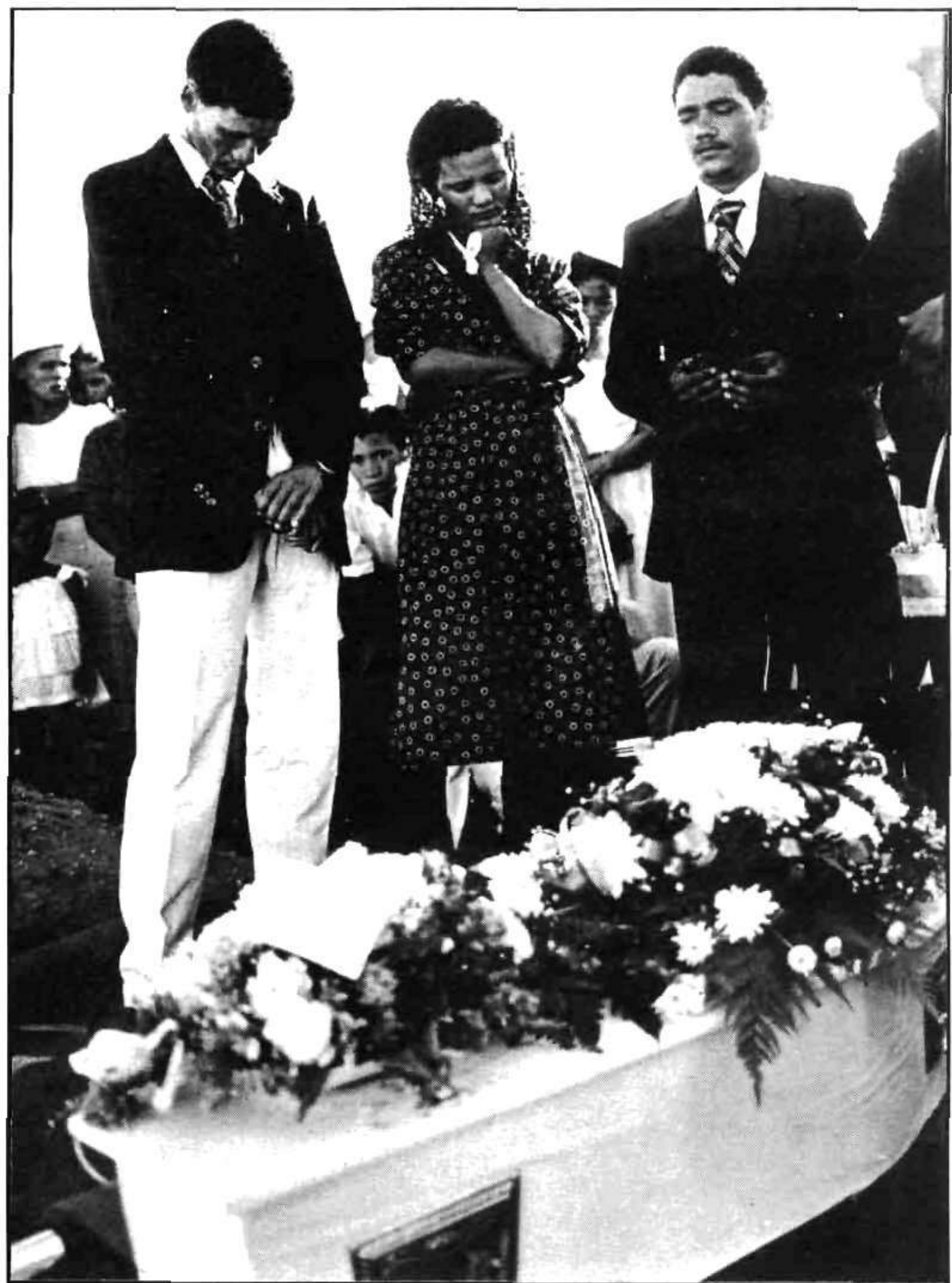
Burying a victim of apartheid - in cases where people have disappeared, families and friends are unable to go through the normal process of mourning that occurs when a person has died