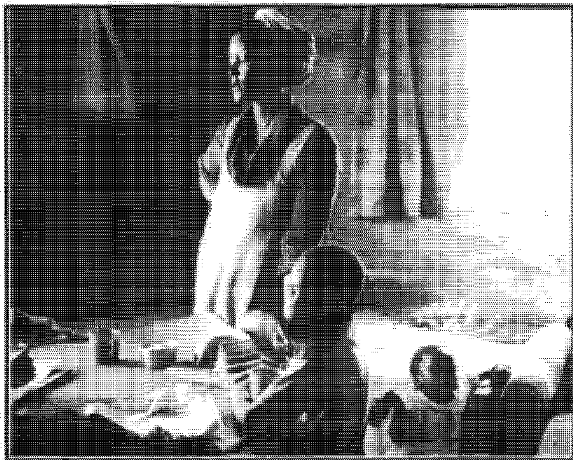
Cuts in health services mean that women must spend more time caring for sick members of the household.

If anything, the effects on women are worse because of the levels of absolute poverty. Evidence is growing that women are worse affected due to expenditure cuts in the social