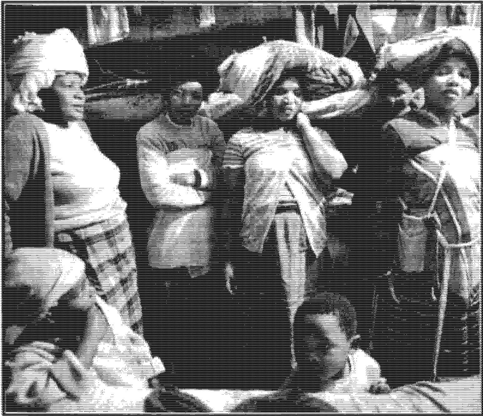
Cuts in food subsidies and rising prices put more pressure on women as they are usually responsible for buying food.

Saharan Africa, a 16 hour workday beginning at 5 a.m. and ending at 9 p.m. is not uncommon. Mothers often balance the conflict between working for an income on the one hand, and domestic work and childcare on the other, by reducing their sleep and leisure time (Bruce, 1989).