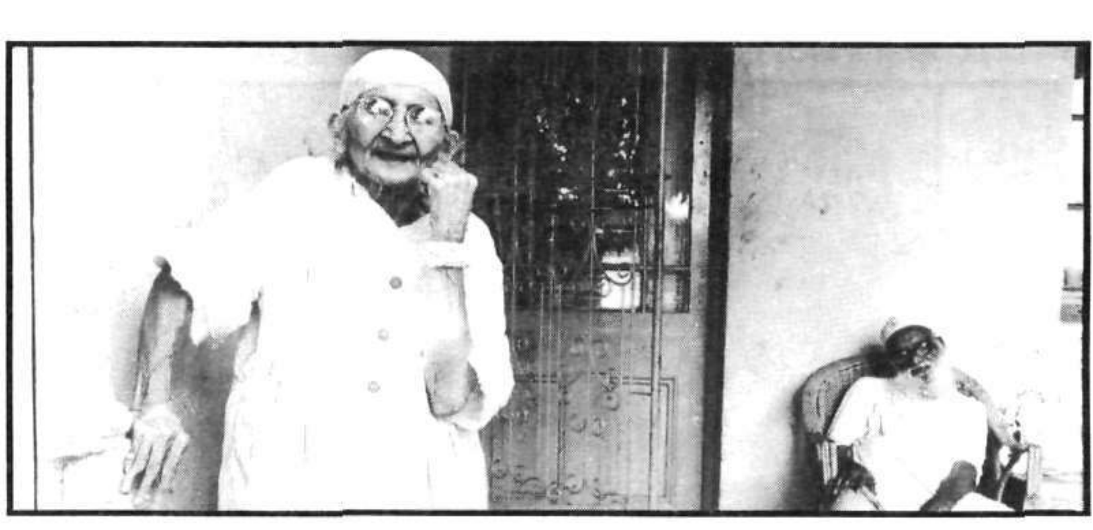
The only available health clinic in the area is inaccessible to many elderly people and to those without their own transport

A meeting of a number of organisations from the community was held earlier this year. The meeting was attended by representatives from over 50 organisations. A Hospital Committee consisting of 21 people was formed.