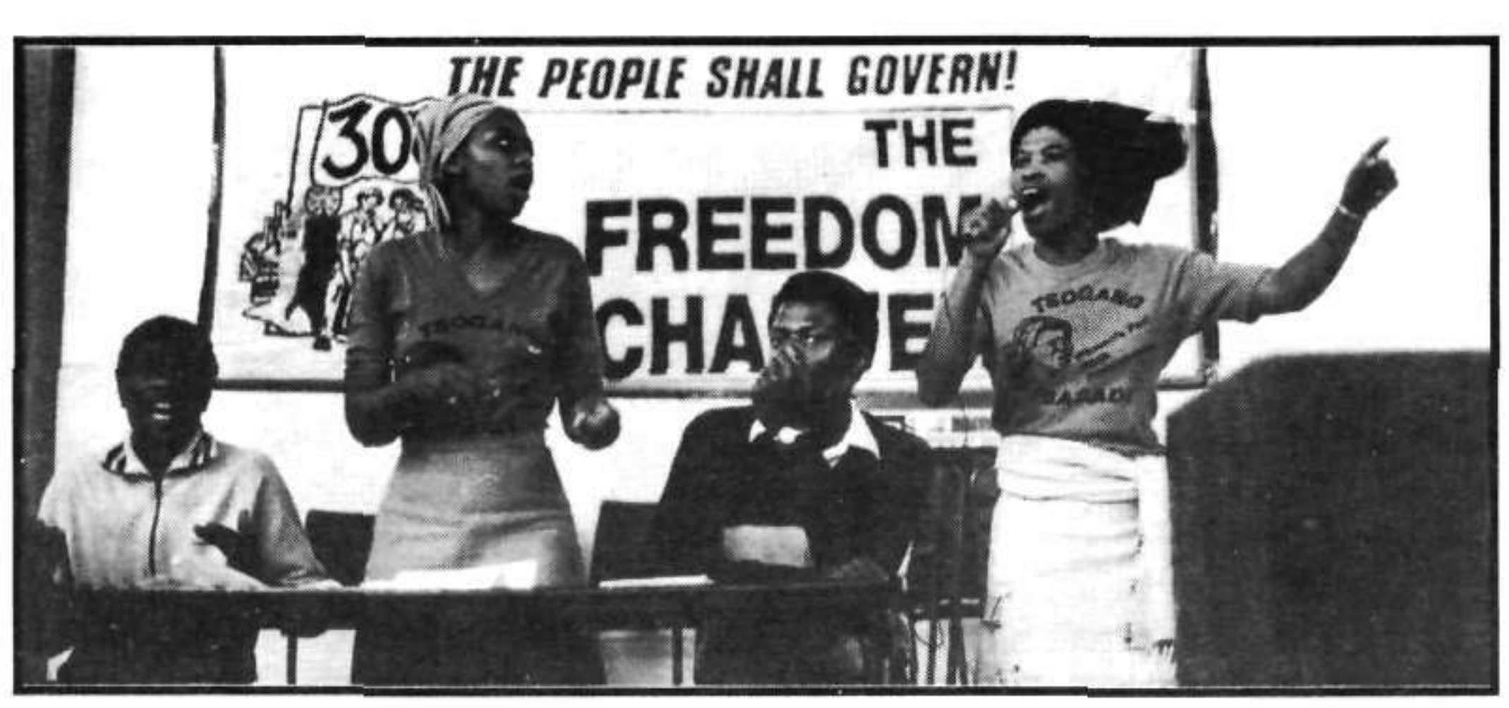
The Hospital Committee has formulated its demands around the Freedom Charter

From the above it is clear that the present health services are grossly inadequate and in a crisis situation.