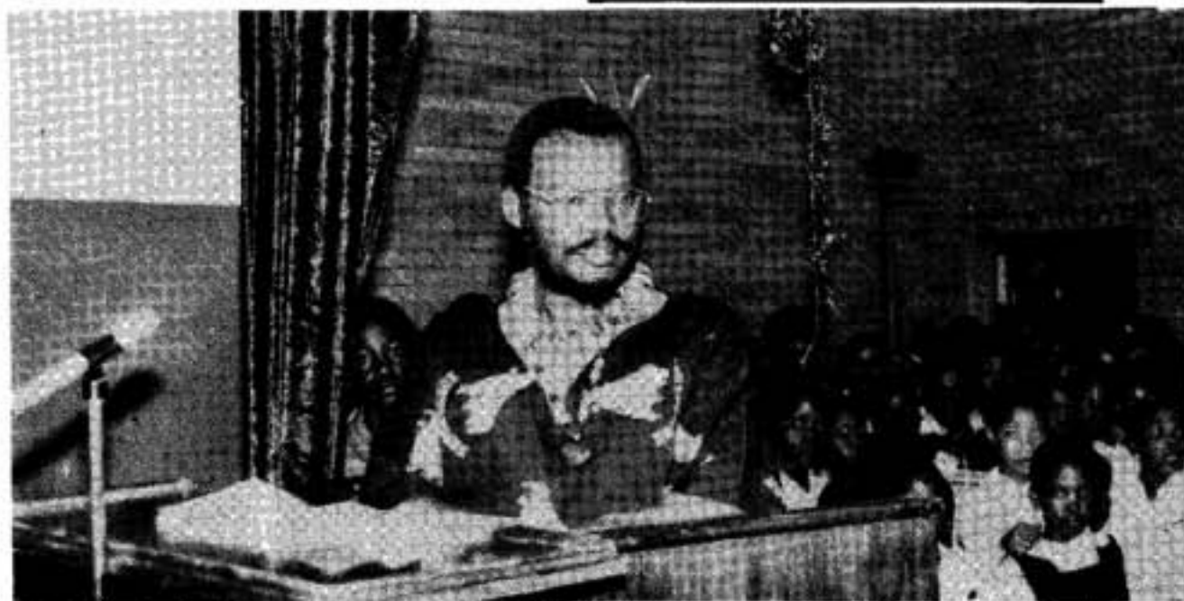
President of Inkatha with the members of the Youth Brigade