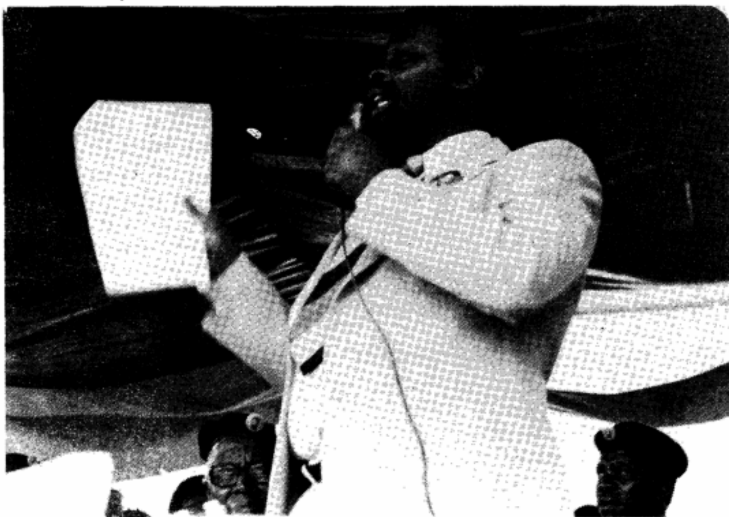
Dr O.D. Dhlomo - Secretary-General of INKATHA

The enforced removals of people by the Pretoria Regime was emphatically condemned by the KwaZulu Minister of Education and Culture, Dr O.D. Dhlomo in the KwaZulu Legislative Assembly.