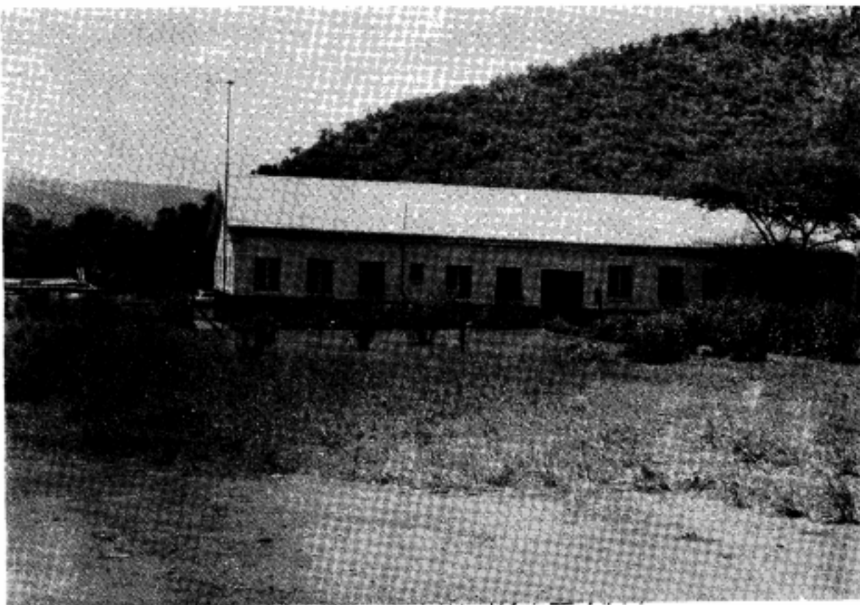
Part of KaNgwane Administration offices.