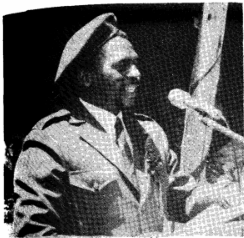
Hon. E. Mabuza, leader of Inyandza Movement — in full regalia.