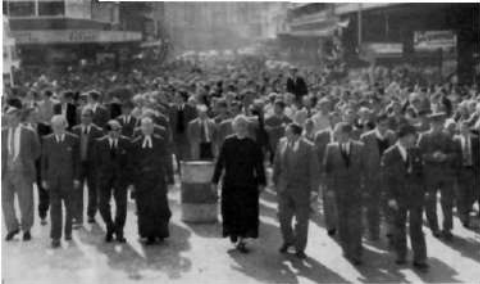
Citizens' Protest March, Eloff Street, Johannesburg