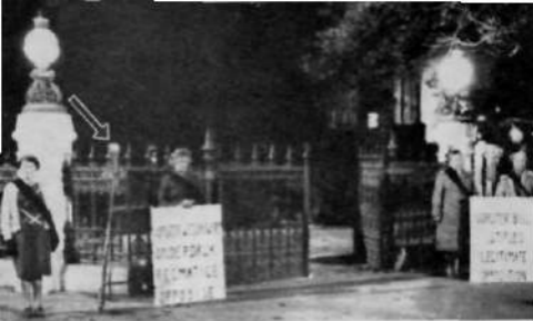
The Flame of Freedom Burns in Cape Town