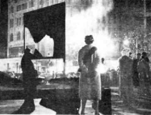
The Damaged Poster