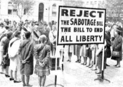
Passers-by join in