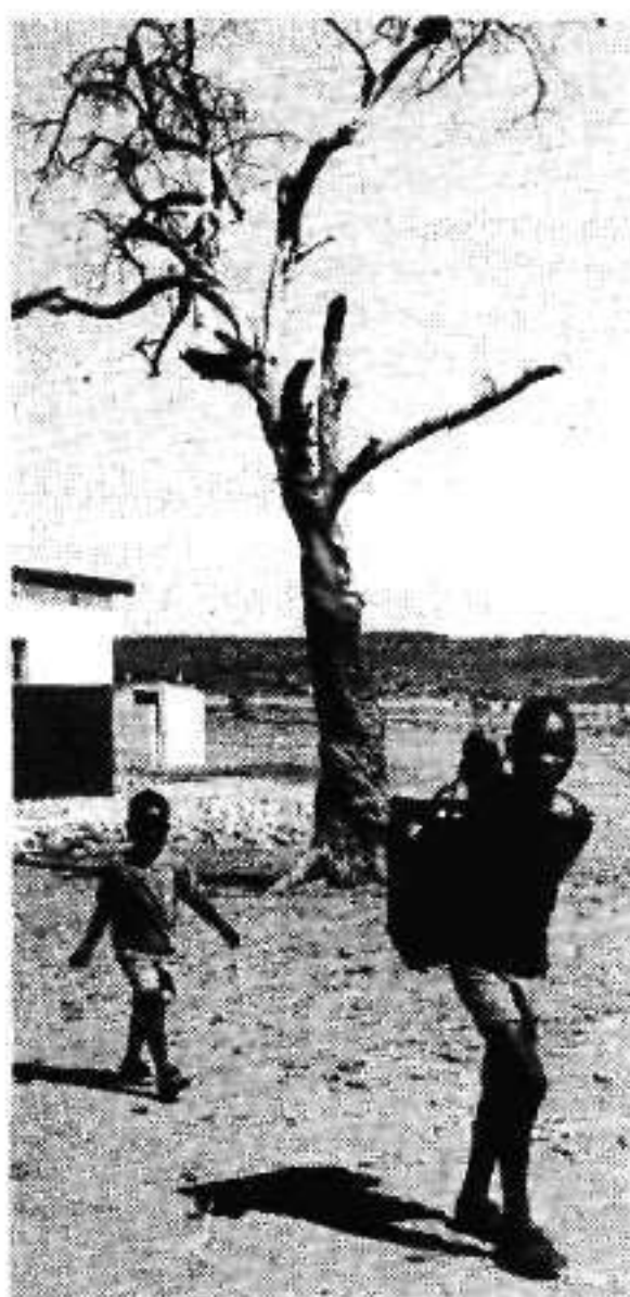
Our children will be locked into unemployment ...

T he Bahurutse ba ga Sebogodi of Braklaagte have lived on their land since before 1907, when they procured their title deed. Braklaagte is an established Tswana village, nestling in the hills of the Marico in the western Transvaal. It has a population of approximately 9 000 people.