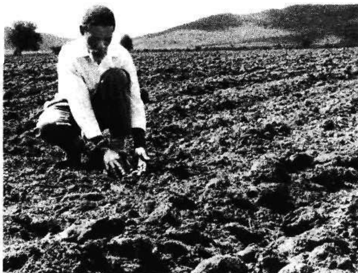
We have lived and farmed at Braklaagte since 1906.