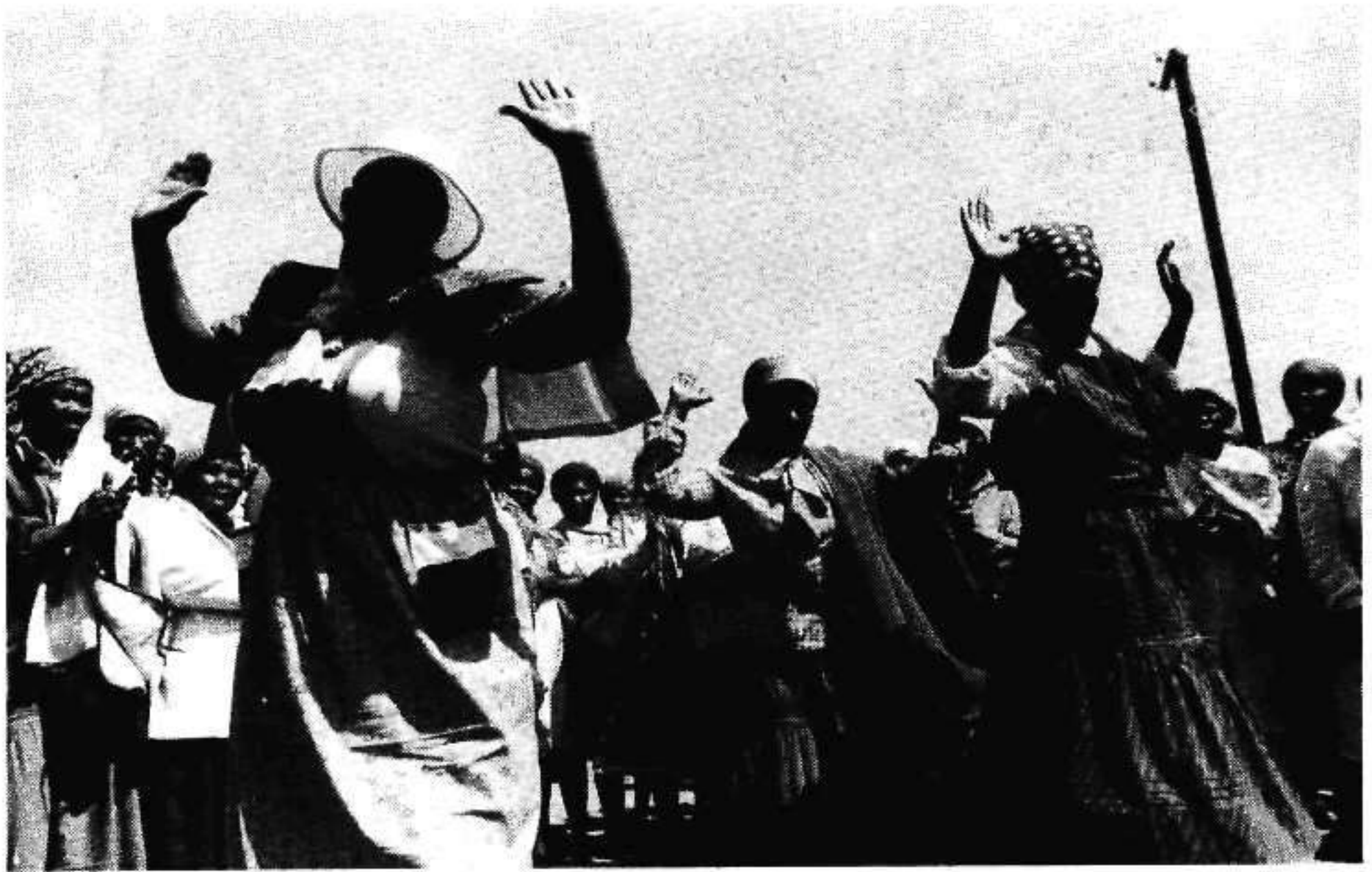
We were very glad that we would be secure in our country as a result. Δ