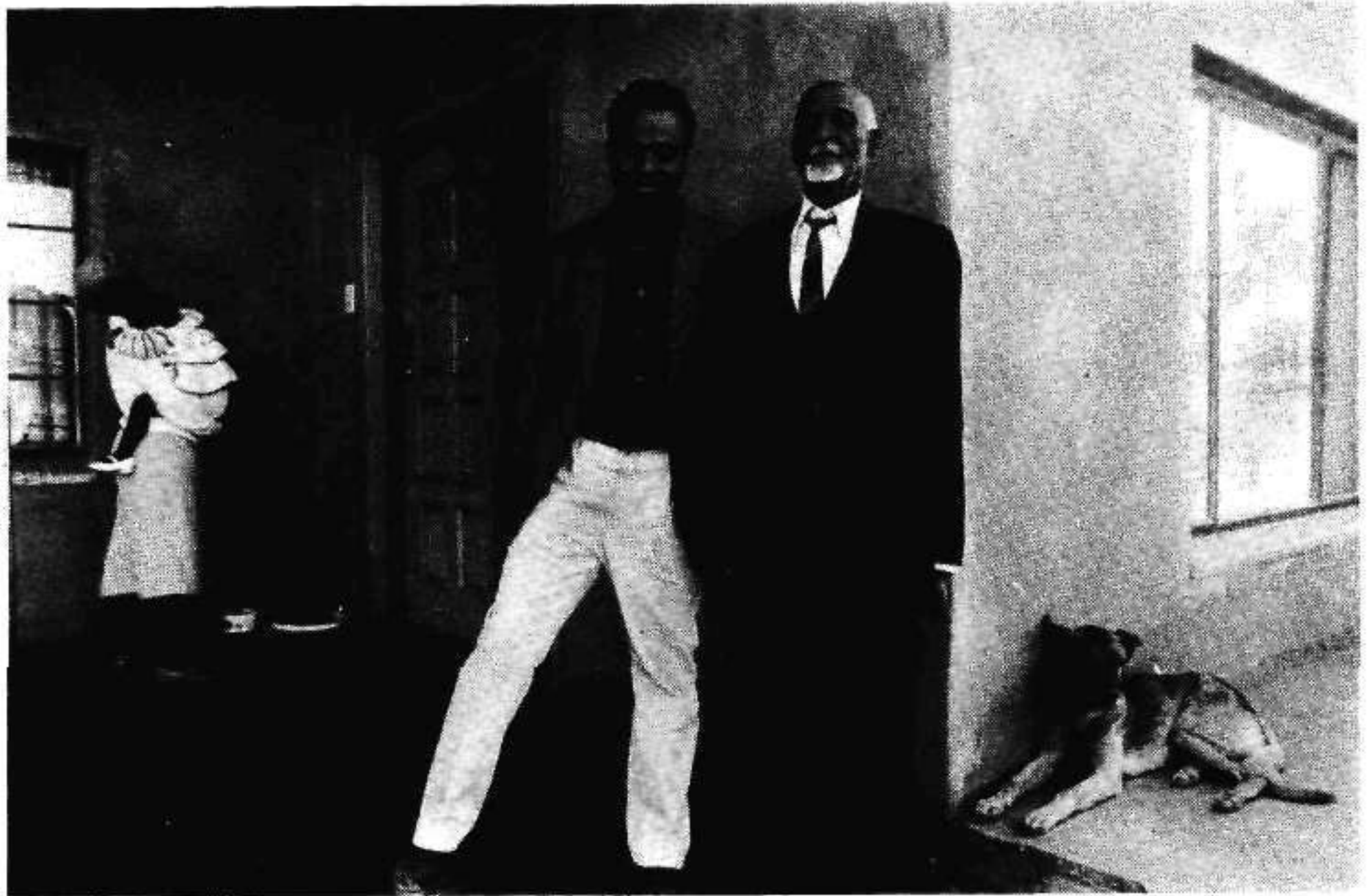
He (President Mangope) has already tried to depose our chief, who has ruled us since 1949. ▽