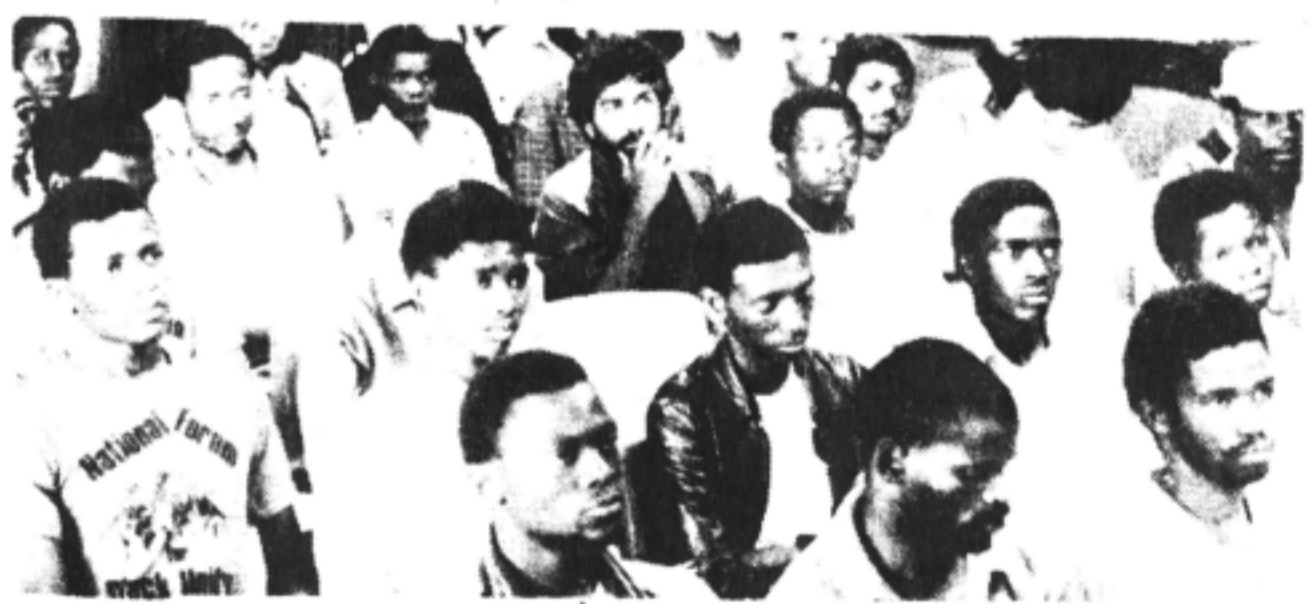
may day meeting