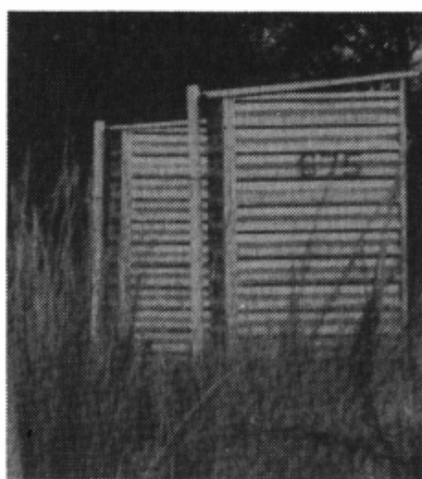
One the DDA's development projects - thousands of unused toilets.