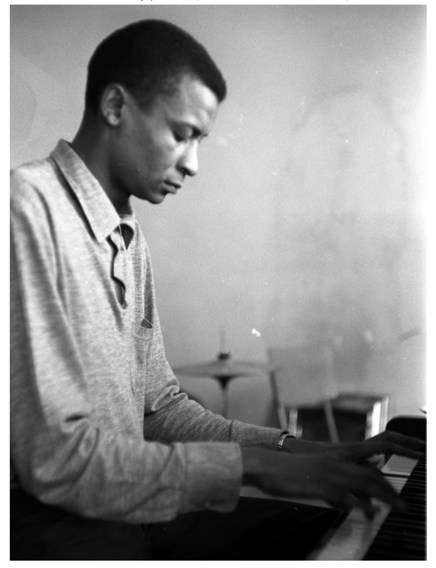
Abdullah Ibrahim (formerly known as Dollar Brand) before he left South Africa in 1959.