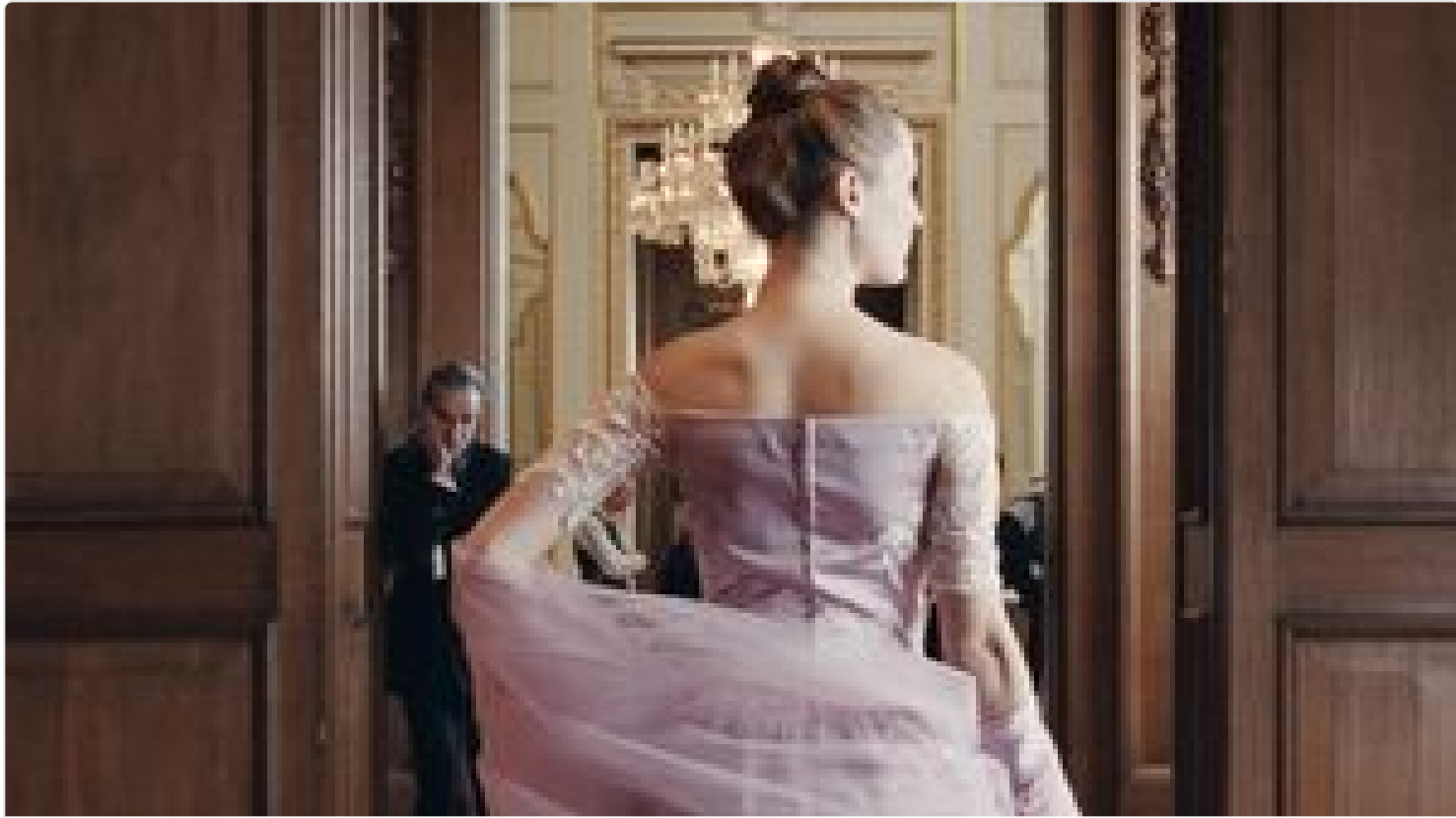
MOVIE INTERVIEWS Oscar-Nominated 'Phantom Thread' Focuses On Fashion's 'Most Obsessive'