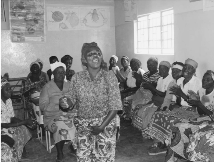
These women welcome visitors to a local clinic and school with a performance. Courtesy of Megan Simon Thomas (2005).

in the particular cultures that refined them and made them famous, in these cases, Congolese, Brazilian, and African American, respectively. In contrast, contemporary music in Zambia generally lacks a distinctive sound or a distinctive dance that one can readily identify as Zambian, although Zambian song lyrics are typically in a local tongue.