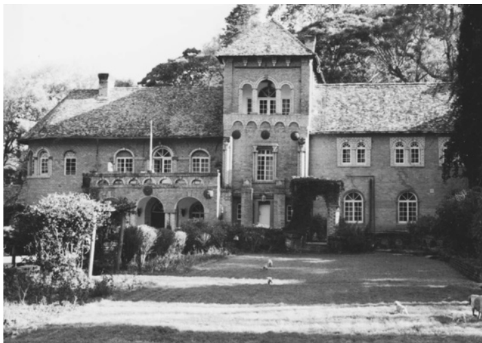
A view of the gardens and main house Shiwa Ng'andu in Northern Province, part of the estate built by Sir Stewart Gore-Browne between 1920 and 1930.

roof tiles that formed the exterior of the massive structure as well as numerous outbuildings. In all, the estate consisted of a chapel, school, hospital, sawmill, cottages, and a store, all of which served the local Bemba community, as well as commercial operations and an energy plant based on a steam boiler. The estate depended on the production of essential oils from which to make perfumes, but it operated profitably for only a few years.