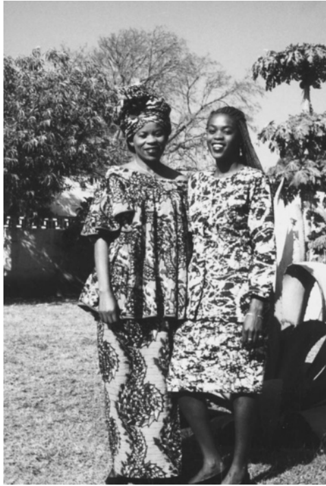
Two examples of fashionable clothing made from chitenge cloth.

During election years, it is not uncommon to see a proliferation of chitenge bearing the images of leading politicians and candidates, and these political advertisements thus become embedded in fashion. Scaling up the ladder of wealth, from poorer rural women to wealthier urban counterparts, it is possible to see increasingly lavish designs in chitenge or other cloth. Indeed, it is not uncommon in Lusaka, for example, to see women of some means wearing beautifully designed, expertly tailored chitenge ensembles for everyday use. Because the fabric is inexpensive, lightweight, and versatile, it is an African alternative to Western fashion. For more formal occasions, women especially will often wear African-themed prints and embroidery. In these fashions, one finds skirts and tops and head scarves as well as larger robes made from two pieces of square cloth with a hole cut for the head and cinched and stitched under the arms, similar to the West African boubou. Frequently, these are made from fabrics heavier and sturdier than chitenge , which is no more rigid than a handkerchief. Whereas this style of clothing is distinctively African—the patterns, the colors, the textures, and the styles