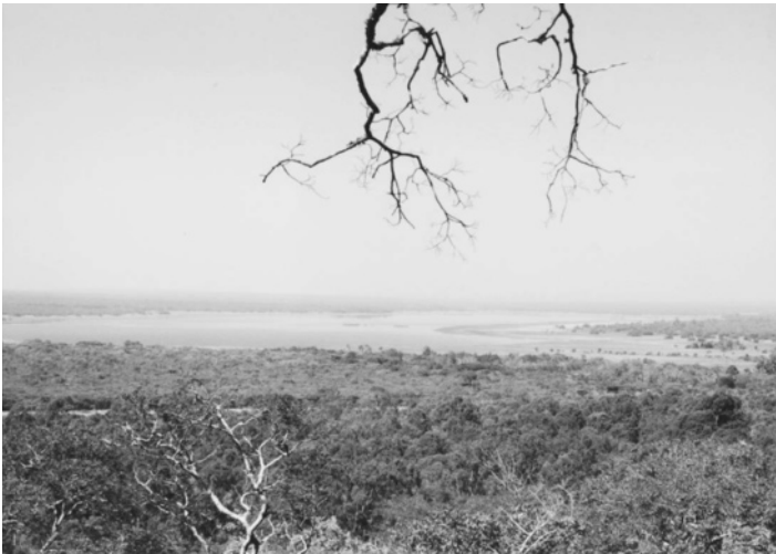
Northern Province landscape. Much of Zambia's landscape is mixed woodland and not well suited to agriculture.

Most of Zambia's soil is highly acidic, sandy, and nutrient poor, although much of that in the Central and Southern Provinces is of higher quality (another explanation for their attractiveness to European settlers). Zambia's indigenous vegetation is mostly deciduous miombe woodland, which consists of tall grasses, trees, and shrubs and covers two-thirds of the country. The drier regions in the Western Province are more desertlike, and the tropical Zambezi valley supports a wider variety of flora. Much of Zambia's woodland area is also endangered, however, due to degradation and human encroachment; rampant deforestation in the country claims an additional 0.5 percent of these wooded areas each year. This is a result of felling trees for firewood to make charcoal—the only source of energy for warmth, cooking, and bathing in rural areas and even in some urban households—as well as overuse of timber for construction purposes. In addition, among peasant farmers, the traditional practice called chitemene (cutting and burning trees and brush to clear for planting and to provide an easy source of nutrients from the ash) has been overused because of both land and population pressures and unavailability of chemical fertilizers. Over time the chitemene method actually depletes the soils of nutrients, leaves great swaths of land bare, and fosters erosion and degradation of many rural lands.