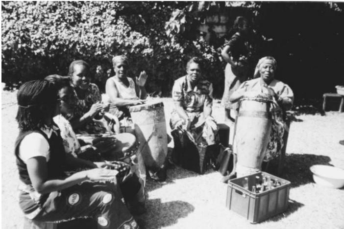
Women drummers at a traditional ceremony.

This is contrary to a number of other well-known musical genres. Despite their diverse origins (including roots in Africa), familiar musical genres such as soukous, samba, and jazz are nonetheless grounded to a substantial degree