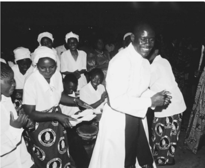
A Catholic seminarian leads drummers and members of the choir during a wedding ceremony.

The appeal of these new churches is manifold. For example, although more and more traditional Christian churches have incorporated singing and dancing far more akin to African traditional rhythms than the standard Western hymnal, the charismatic evangelical churches tend to incorporate a degree of singing and dancing in the audience, combined with a potent sermon delivered with fiery oratory, that results in a livelier service. Because many young Zambians no longer feel beholden to the faith traditions of their parents (much as they had deserted the pre-Christian beliefs of their own forebears), the congregants tend to be younger as well. They also employ a number of traditional elements: singing, dancing, and praise-singing that