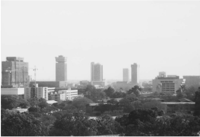
Several high-rise office buildings punctuate Lusaka's downtown skyline.

part of the nineteenth century, missionaries introduced brick making, and this method remains commonly used in home construction throughout the country, although in remote rural areas one is less likely to find many structures composed of brick.