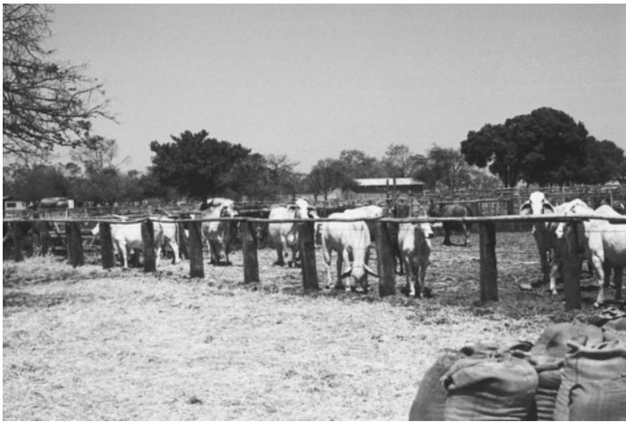
A commercial farm in Central Province has sufficient resources for cattle raising.

Zambia's myriad lakes and rivers contribute to a diet that tends to be rich in fish, although, interestingly, most ethnic groups do not have a strong fishing tradition. The Lozi people, however, are considered to have a fish-heavy diet, probably due to their proximity to the Zambezi River. Similarly, communities such as Mpulungu, the town bordering Lake Tanganyika in Northern Province, are largely based on fishing for their livelihood. Native and nonnative species are abundant in Zambia's waters, including everything from larger sport fish such as Nile perch and tiger fish, to tilapia (bream) and the tiny kapenta , which measures just a few millimeters in length. Each group has its own methods for catching fish, which may include the use of baskets, barbed spears, and the temporary obstruction of rivers. Preparation methods also vary according to ethnic traditions. Although perhaps the preferred