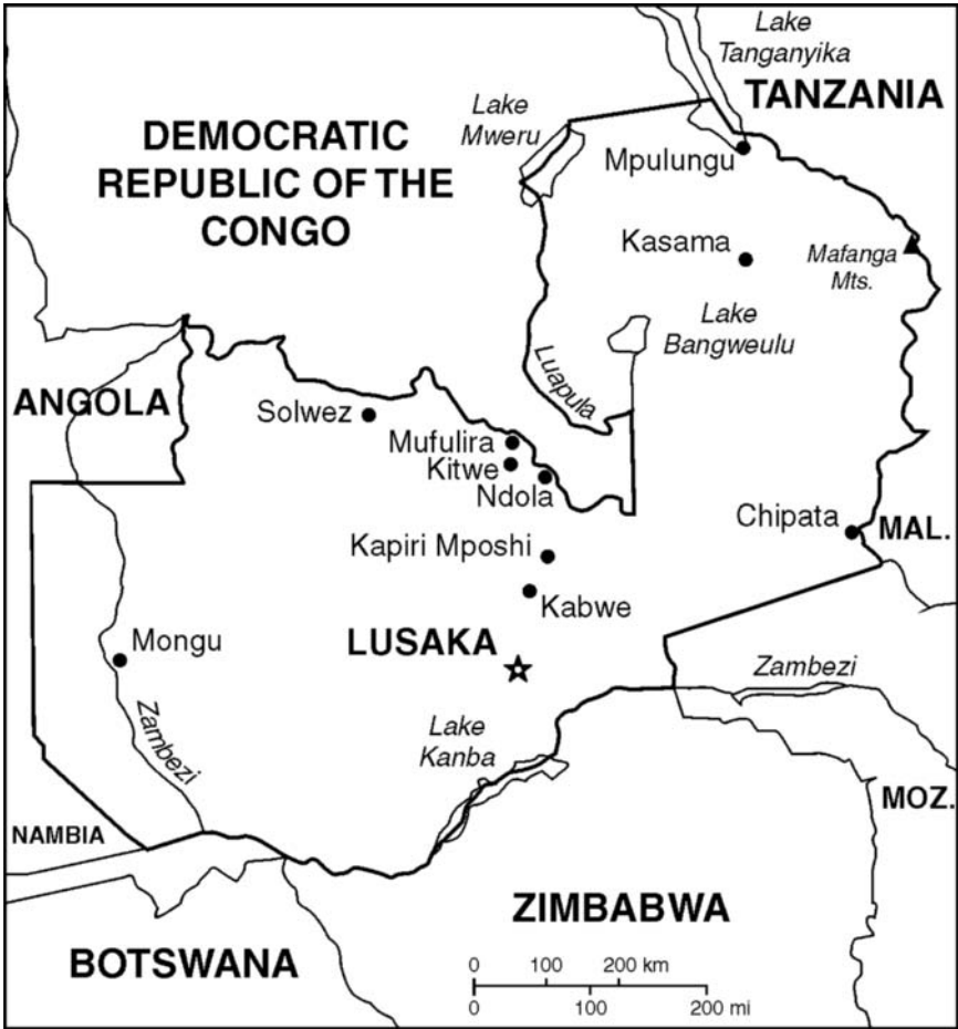
Zambia.