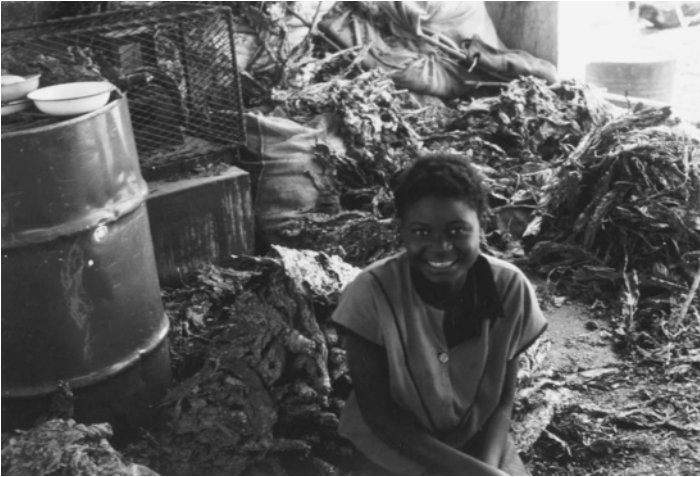
A woman dries tobacco. Many farmers hoped exports like tobacco could reduce Zambia's economic dependence on copper.

however, due to flaws in both design and implementation. Furthermore, the austere spending reductions called for by the World Bank and the Fund—including elimination of certain subsidies on the consumption of the staple food, maize meal—caused urban riots in 1986 that left more than 30 people dead, and President Kaunda was forced to halt the program.