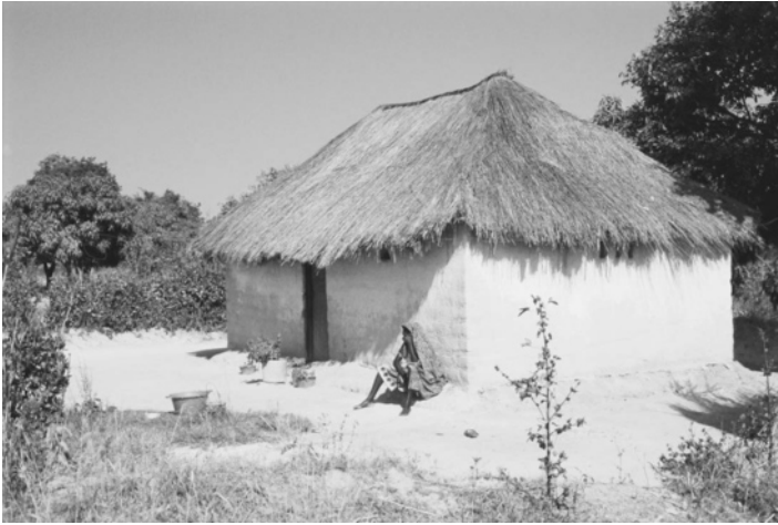
A Zambian thatched cottage.

continue to reside in makeshift housing, but even the more permanent structures that occupy the compounds may lack electricity and internal plumbing, forcing households and sometimes whole communities to rely on latrines and communal water taps.