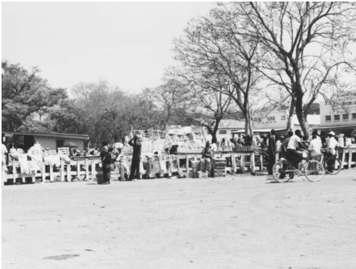
Many Zambians purchase their goods and produce at outdoor markets like this one.

In almost all Zambian cities and towns, most foods can be purchased at a supermarket. Several large grocery chains, dominated, as is much of Zambia's private sector since the 1990s, by South African firms, occupy Zambia's major cities. These stores are virtually indistinguishable from the Western prototype: characterized by large, well-lit aisles, extensive food selection, a range of nonfood items for sale, and a long bank of registers at the checkout counter. Middle-class families residing in major towns like Lusaka, Ndola, or Kitwe, for example, buy the majority of their food at the supermarket, although they will often go to the open-air or specialty markets to buy fish, vegetables, and maize meal, where items are more easily inspected and prices