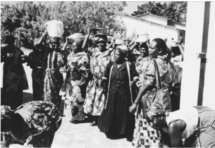
Women prepare and deliver the food to the groom and his family as part of the amatebeto .