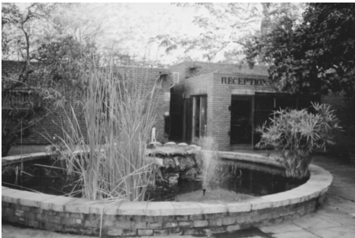
The garden and fountain at the entrance to a Zambian office building in Lusaka's Roma neighborhood reflect the variation in commercial architectural style.

Like any city, Lusaka consists of a diverse set of neighborhoods—among them Kabulonga, Woodlands, Kabwata, Kamwala, Avondale, Garden,