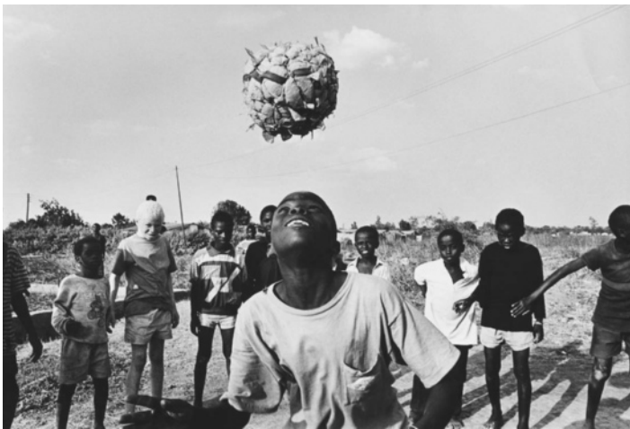
Boys practicing soccer techniques with a ball made of woven plastic bags.

The Zambian National Football Team, Chipolopolo, is perennial focal point for Zambians of all ages and socioeconomic backgrounds. Chipolopolo has enjoyed international recognition; many players participate in more