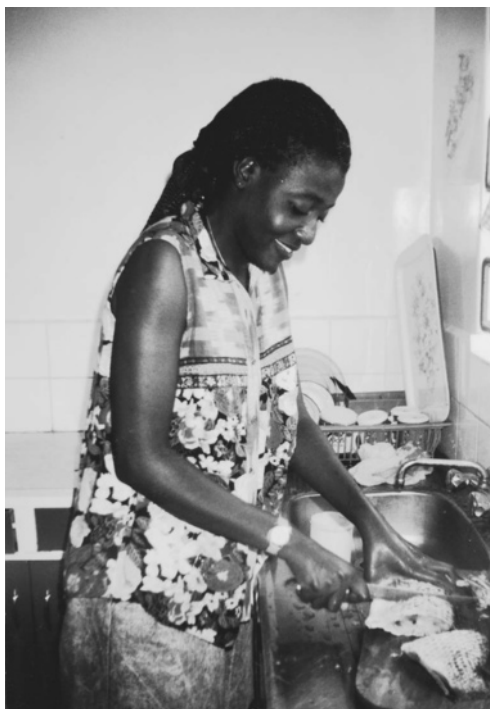
A woman prepares fish, which is abundant in Zambia's rivers and lakes.

A basic breakfast generally consists of bread or porridge, usually made of maize, together with tea. Eggs are also abundant and inexpensive, whereas Western-style breakfast cereals are also on the rise in urban households. Lunch often consists of nshima with one or more of the relishes described previously, the type and variety of these supporting dishes determined by the wealth of the diner. In the home, dinner may consist of any leftover relish from lunchtime, although, almost invariably, nshima will be made fresh with each meal. Indeed, something of a ritual surrounds the preparation and distribution of nshima in the household, and it is considered ill-mannered to serve someone leftover nshima . In traditional practice, hands are washed at the table (in the