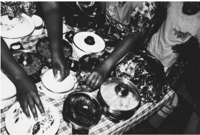
Various traditional dishes are presented at the amatebeto ceremony.

Food and the preparation of food play central roles in a number of traditional ceremonies. The Bemba amatebeto , also discussed in chapter 6, is part of the marriage ritual in which the female relatives of the bride prepare a feast for the groom and his family. Typically offered in the weeks before the actual wedding, the amatebeto requires the female members of the bridal party to prepare all the traditional foods, which are then brought to the groom's residence. The preparation is marked by singing, stories, and camaraderie at the home of the bride's mother. The foods, both exotic and familiar, are presented one by one—chicken, chikanda , ifkubala , the list is extensive—and it is explained that these foods are those that the bride herself will later prepare as part of her wifely duties. The Bemba ukwingisha shifyala , which may take place many years following the wedding, also involves food. Because the ukwingisha shifyala marks the symbolic acceptance of the son-in-law into the family, it is celebrated with food; he brings his family to his wife's mother's home for a meal. According to tradition, he is not allowed to dine with his mother-in-law prior to that time.