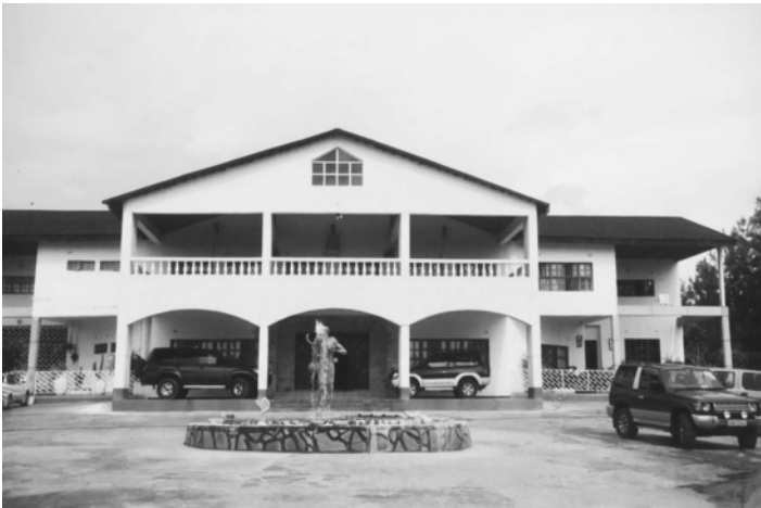
An elite residence on the outskirts of Lusaka in Leopard's Hill.

The urban compounds are in many ways a vestige of colonialism. 7 Lusaka's Garden City was designed for Europeans and Asians; Africans were permitted to live in the city when employed. "African workers lived either on the property of their employer or in 'compounds' and in most cases could not be accompanied by their families. Once employment was terminated, a worker was required to leave the city and return to his village." 8 Because permanent urban settlement was deliberately discouraged in the 1930s when Lusaka began to expand, Africans' housing was rudimentary at best. Moreover,