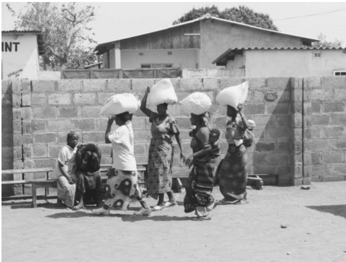
Women carrying heavy loads, such as these bags of maize on their heads and children on their backs, is a familiar sight throughout Zambia.

Males and females approach daily life quite differently. Girls and women in cities like Lusaka are responsible for cleaning house and doing the laundry and cooking. In rural areas, to these tasks are added looking after children, gathering water and firewood, and engaging in subsistence farming. Boys may have a narrower set of chores and will often be found playing football (soccer)—a ubiquitous sport in Zambia. Men cultivate fields in rural communities or work elsewhere. In both rural and urban environments, men are less likely to work around the house when they are through with their wage-earning activities. Men, therefore, typically, will sit together and talk, play games together, and perhaps drink beer together, if they have access to it. Few cultural prohibitions in Zambia prevent men engaging in what may be regarded—in some countries and among some cultures—as women’s work, such as doing laundry and cooking. Nonetheless, it would be uncommon to see a male performing these chores if he has a wife or female relative around. Although the colonial government compelled many able-bodied males into the wage economy, including into the mining sector as labor, it also introduced cash-cropping to many rural areas. Thus, men became responsible for cash crops—and claimed the revenue they generated—whereas women remained in control over subsistence, that is, the household and production.