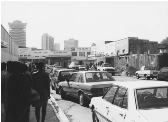
This street in Lusaka's Luburma/Madras area is a hub of commercial activity. Most of the shops are owned by Zambians of Asian descent.