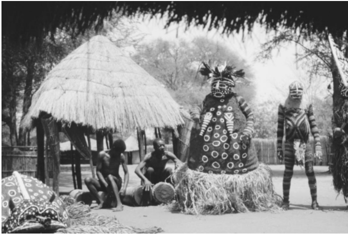
Dancers in costume perform a Makishi initiation ceremony.

As noted previously, nearly all Zambian ethnic groups can lay claim to a myth of origin and, at some point in their history, celebrated their beginnings. The Luvale of North Western Province, for example, hold a festival called Likumbi Lya Mize, or “the Day of Mize,” which celebrates Mize, the ancient capital of the Luvale people. Held annually in July or August and lasting several days, the Likumbi Lya Mize features the renowned Makishi dancers, the group of young men who wear the elaborate masks known by the same name, which represent key figures in Luvale mythology. The Makishi dancers also perform at the Mukanda circumcision ceremony, described later. The related Chokwe people have a similar tradition.