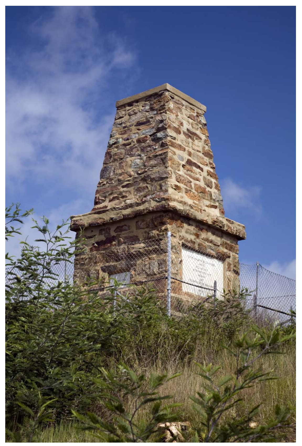
<u>Figure 2</u>: The Indian Monument on Observatory Ridge in 2009