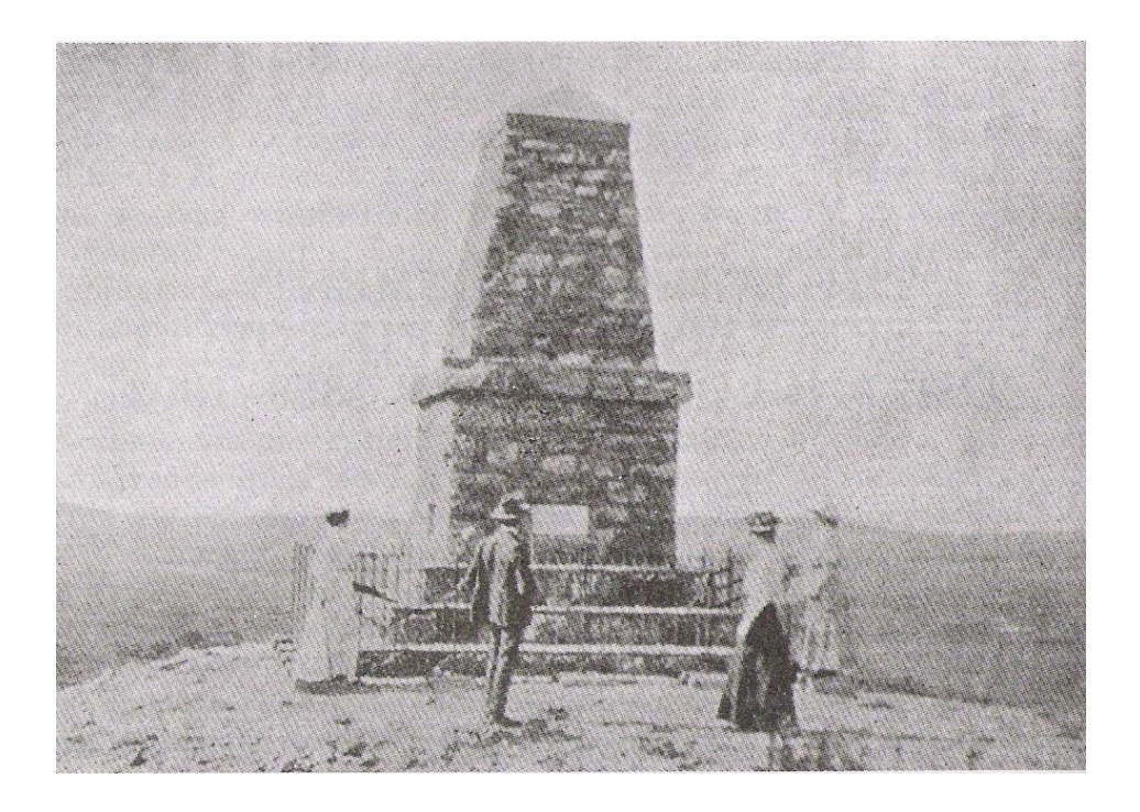
<u>Figure 1</u>: Johannesburg's first war memorial: the Indian Monument dates from 1902. Photograph: Doke, J. <u>M.K. Gandhi: an Indian patriot in South</u> <u>Africa</u>. London Indian Chronicle, 1909.