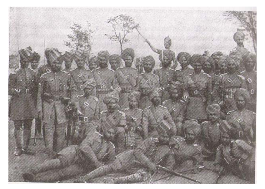
<u>Figure 3</u>: Bengal Lancers at the Kroonstad Remount Camp. As shown here, certain of the Indian forces carried arms, as they were part of the Indian Army. Photograph: Wilson, W.H. <u>After Pretoria: the Guerilla War</u> p. 282.