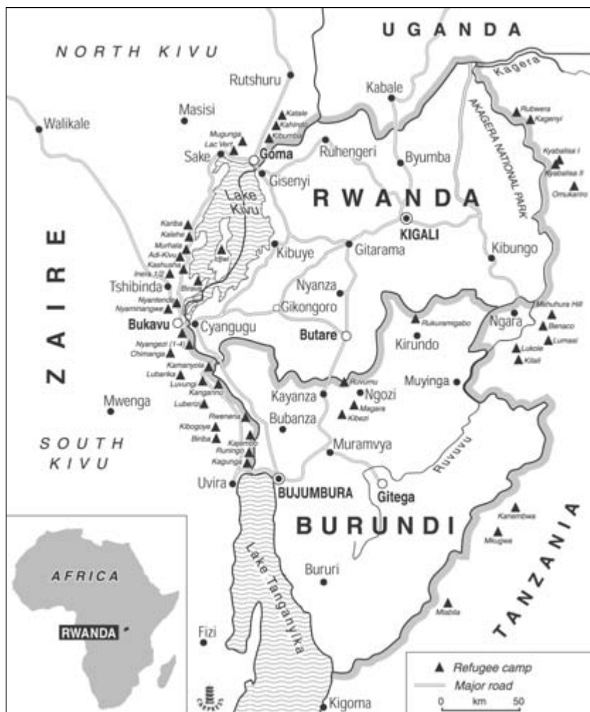
Refugee camps in Zaire, Burundi, and Tanzania