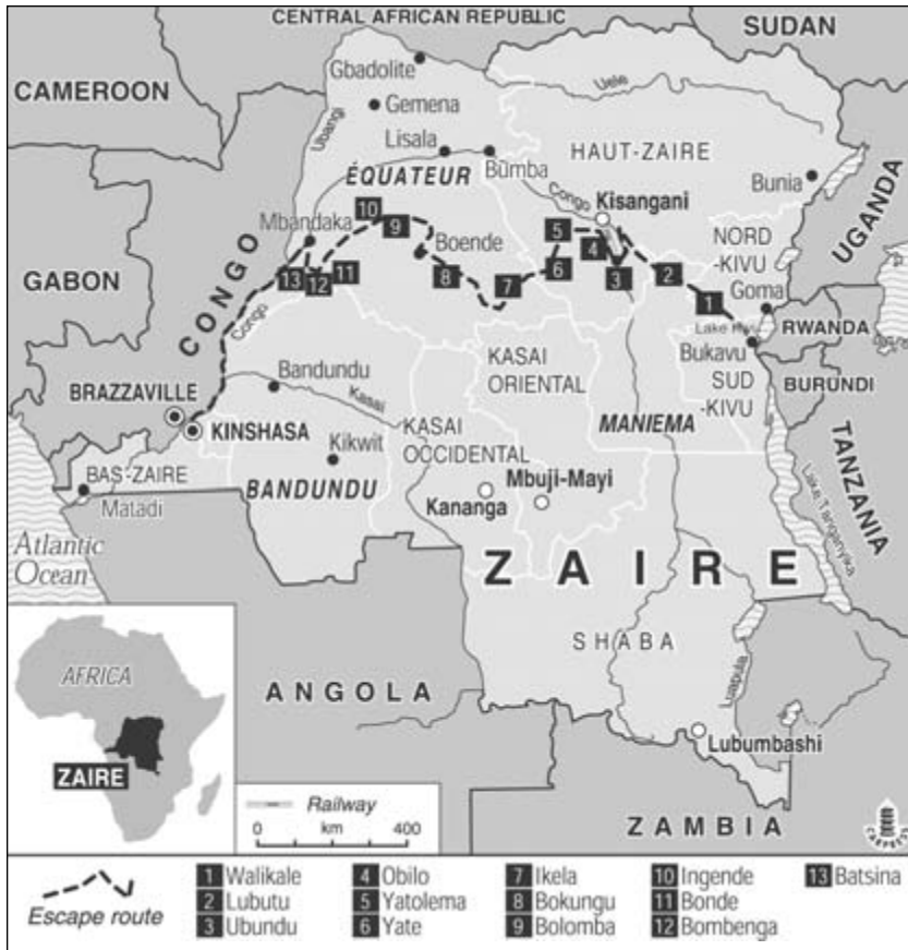
Route followed by the author in Zaire