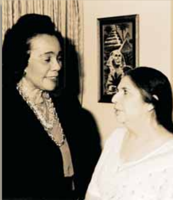
With Coretta King