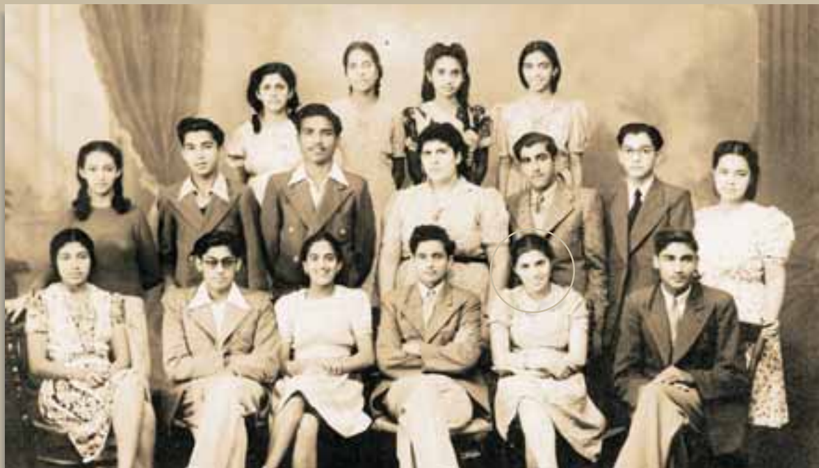
Student Passive Resistance Council 1946