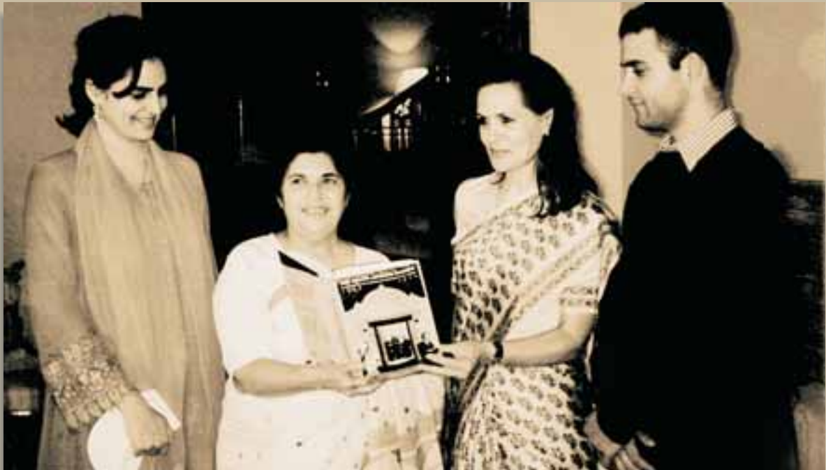
With Priyanka, Sonia and Rahul Gandhi