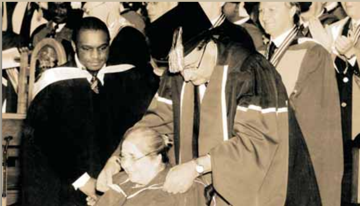
Receiving an Honorary Doctorate from Rhodes University 2007