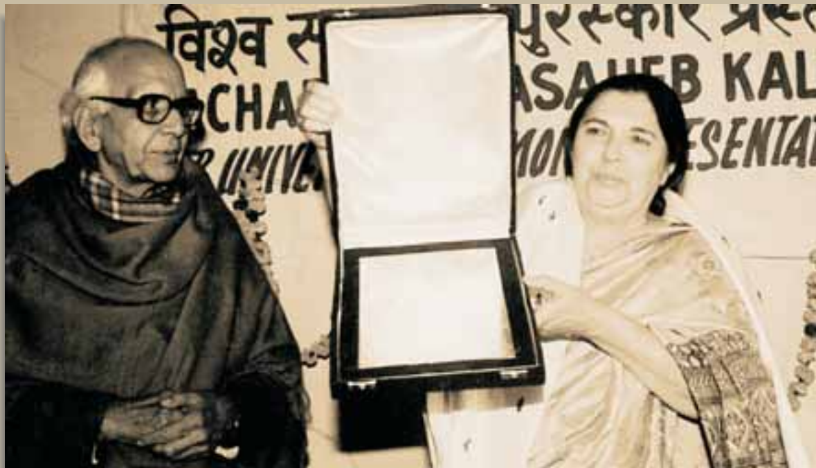
Receiving the Acharya Kakasaheb Kalekar Universal Harmony Award in New Delhi 1996