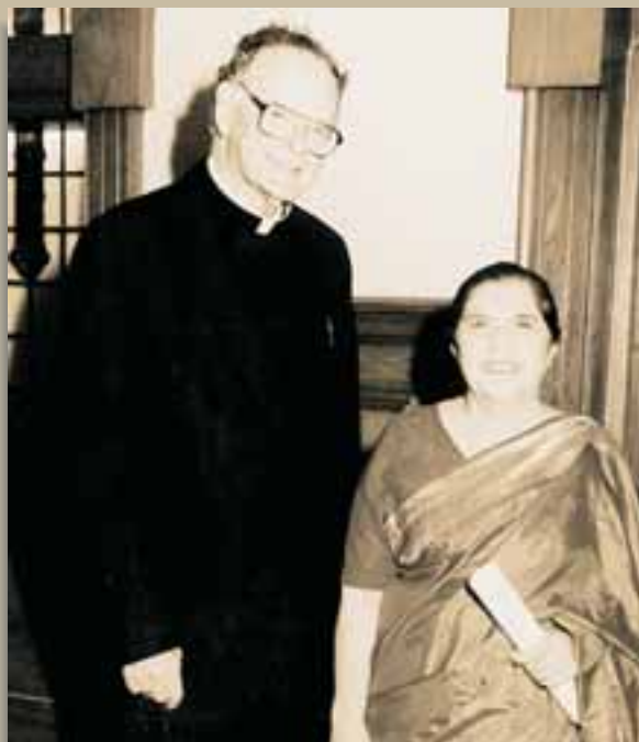
With Archbishop Dennis Hurley