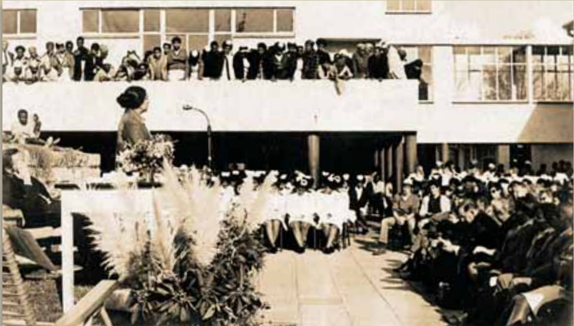
Guest Speaker at Charles Johnson Memorial Hospital 1971