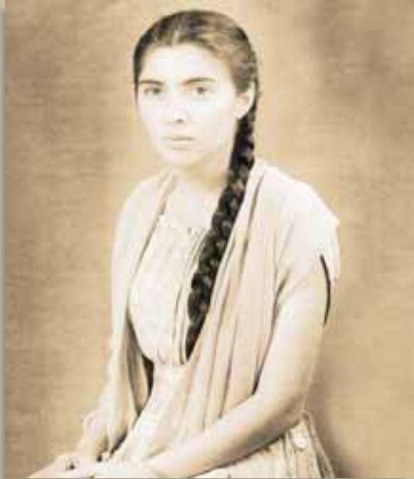
Fatima Meer 1948