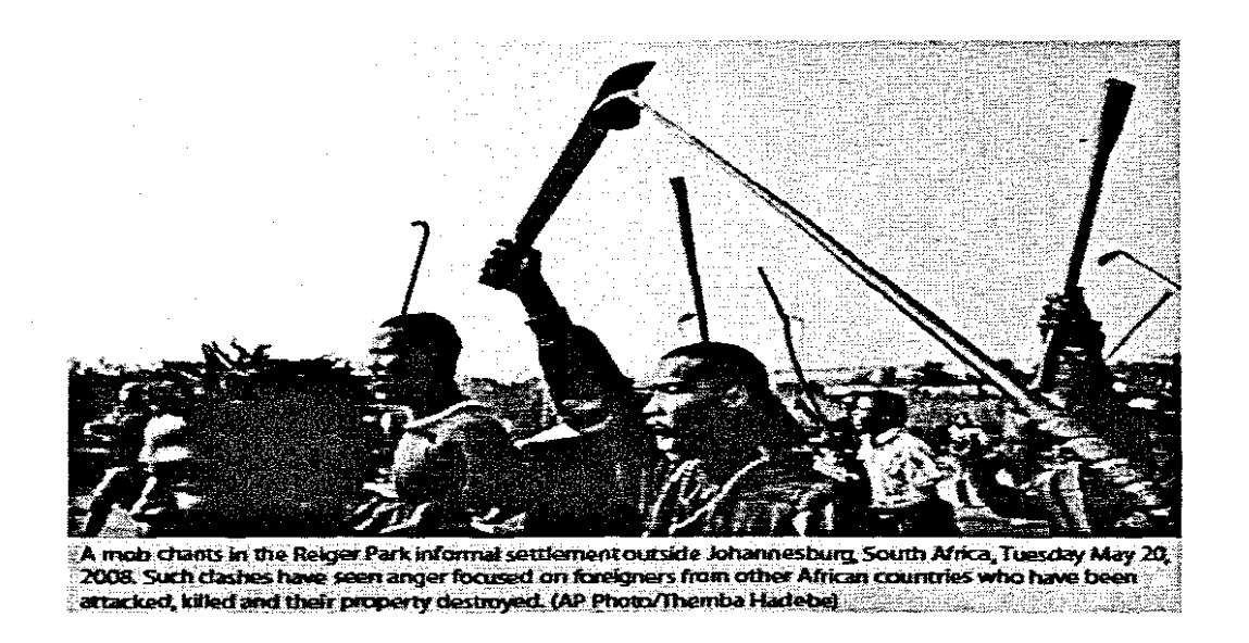
Figure 3 Showing a mob of South Africans attacking foreigners

Police had arrested more than 200 people on charges including murder, attempted murder, rape, public violence and robbery. Armed police used tear gas and rubber bullets to quell rioting in central Johannesburg, attacks on foreigners and looting of foreign owned shops. The violence then spread to the coastal city of Durban.