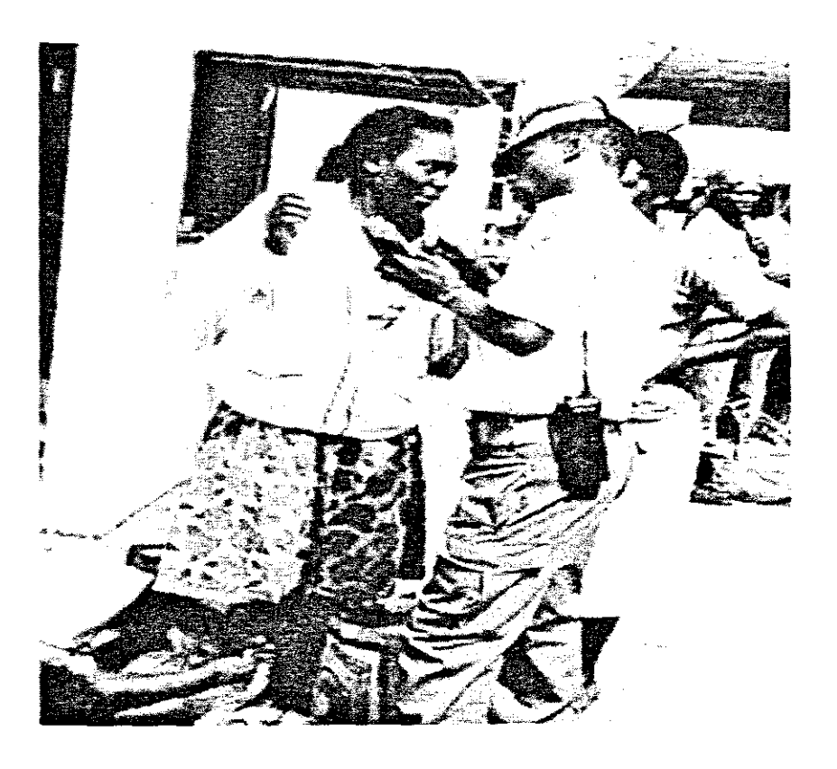
Figure 2: Foreigners were often stopped on the basis of their appearance and asked to provide evidence of their status.

What is evidenced by this is that the very system that is supposed to assist the entry and stay of African immigrants is often corrupt since it is subverted by some of the police. (See figure 2).