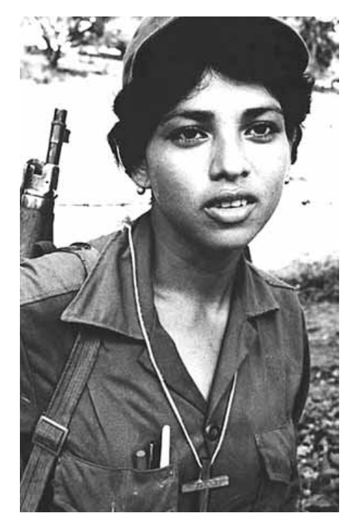
Sandinista woman soldier

It is true then that in a revolution elements of one's personality tend to be repressed. For opera-