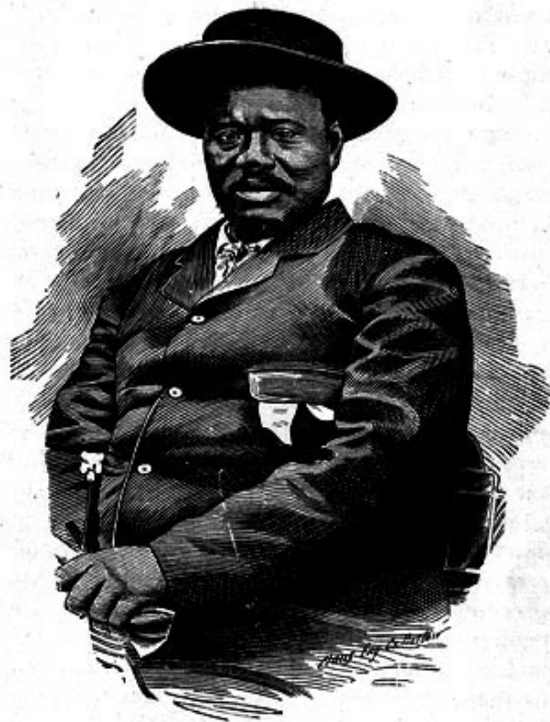
CETYWAYO (in English dress.)